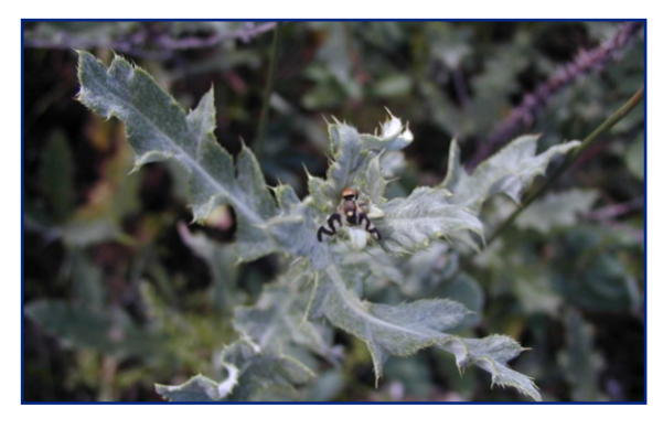
This bio-control fly (Urophora cardui) will lay its eggs in the stem of this Canada thistle plant. Once the larvae hatch they will form a gall on the stem of the plant, stressing it and reducing the flowering potential above it.