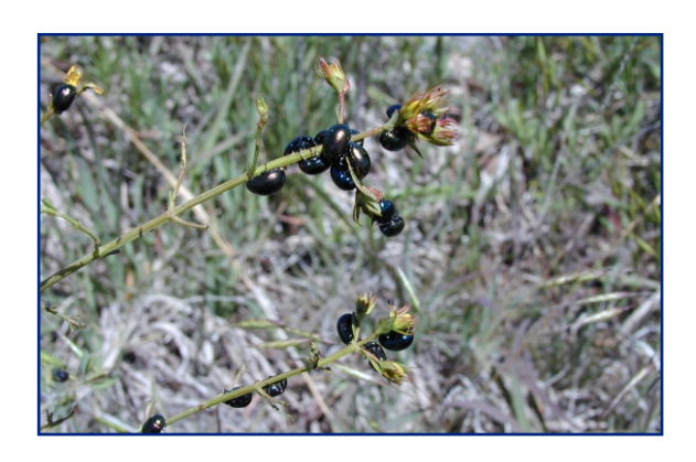
These metallic-looking beetles (Chrysolina quadrigemina) are foliage-feeding beetles that have almost devoured this Saint John's wort plant.