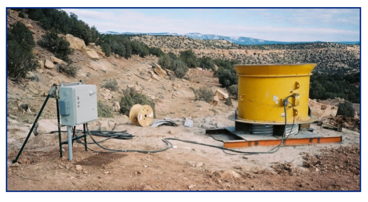
Ventilation fans, such as this one at the C-SM-18 Mine, supply fresh air to the mine workings.

just under $500,000 annually and these revenues have been appropriately sent to the Department of Energy Administrative Treasury account. The production royalties that are expected when mining actually begins will be based on bids that range from 7.67 percent to 36.2 percent. With these results the program will continue in good standing. This concludes the first bid opening of this kind in 34 years and all of the successful lessees and uranium program leasing information is being updated and posted on the LM website.