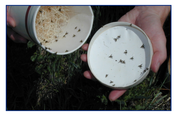
These bio-control insects, Canada thistle stem gall flies (Urophora cardui), come from the Colorado Department of Agriculture in a small container ready to be released in the field.

Bio-control insects do not completely eradicate the noxious weeds species, but rather reduce dense populations to more manageable levels. Once the populations are established, they help keep the overall abundance of weeds at lower levels than what they would be if the bio-controls were not present.