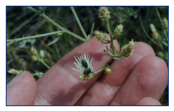
Seed-eating weevils (Larinus minutus) laying their eggs in the flower heads of diffuse knapweed. Once the larvae hatch they will eat the developing seeds, thus reducing the amount of seed that will be dispersed in the area.