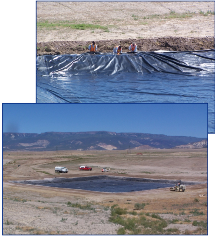
Completed Installation of In-Cell Pond Liner.