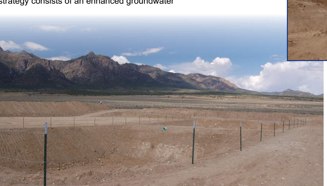
DOE Site Manager Mark Kautsky inspects the completed well pads at the MV-5 drill pad, Central Nevada Test Area.

Drill pads are required for the new wells because the drilling depth will require a stable surface upon which to work. The drill pads also contain infiltration ponds for the safe disposal of drilling fluids that will be generated. Construction of the drill pads was completed in September 2008 and drilling is planned to begin in April 2009.