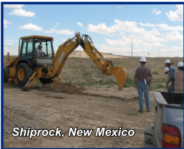
Shiprock, New Mexico