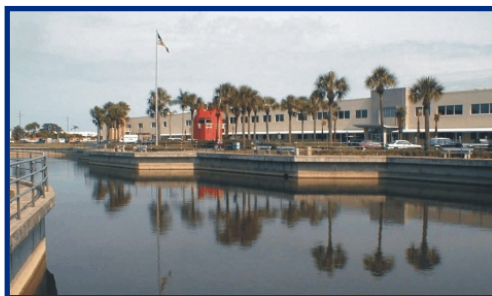
Young - Rainey STAR Center (formerly Pinellas Plant) Largo, Florida

DOE and the Pinellas CRO have created or retained more than 3,190 jobs in the region.