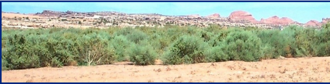
Fourwing saltbush field planted in contaminated soil at the source of a nitrate plume.

saltbush and black greasewood. When healthy, these plants can send roots more than 40 feet into ground water, and, like so many straws, suck about 380,000 gallons of plume water and 100 pounds of nitrate (as nitrogen) per acre in a year, a process called phytoremediation. A nitrogen-15 isotope enrichment study indicates that by the time ground water approaches the far end of the plume, microorganisms will have converted nearly half of the nitrate to harmless nitrogen gas, a process called microbial denitrification.