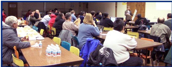
March 2006 public meeting in Riverton, Wyoming

The preliminary draft Uranium Leasing Program Programmatic Environmental Assessment (EA) was reviewed by three "Cooperating Agencies" in accordance with the National Environmental Policy Act (NEPA). Comments were received in March and are being evaluated. The U.S. Bureau of Land Management had extensive comments. In addition, LM has initiated consultation with five Tribal Nations who historically inhabited the region involving the Uranium Lease Tracts. Once tribal concerns are resolved and Cooperating Agency comments are taken care of, the draft EA will be reviewed by an internal LM NEPA Planning Board to ensure that the draft is ready for public review. Public review will last for 30 days and will involve public meetings. It is anticipated that the public review will occur in summer 2006.