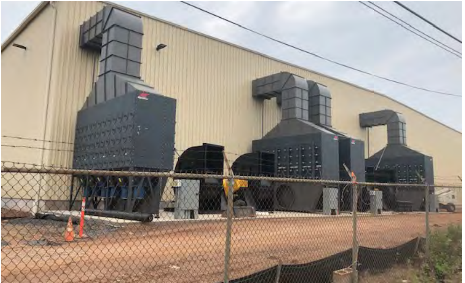
Construction of the new waste transfer station, New Brunswick, New Jersey, Site, June 2019.

development of the nation's nuclear weapons and atomic energy programs. DOE has the legislative authority under the Atomic Energy Act (AEA) of 1954, as amended, to perform radiological surveys, monitoring, and maintenance at sites used to support the nuclear activities of DOE's predecessor agencies. DOE also has legislative authority under the AEA to remediate FUSRAP sites identified as requiring some form of response action. In 1997, Congress transferred responsibility for FUSRAP site characterization and remediation from DOE to the U.S. Army Corps of Engineers (USACE). The DOE Office of Legacy Management (LM) retains responsibility for long-term care of remediated FUSRAP sites. For more information about the program, please see the FUSRAP fact sheet .