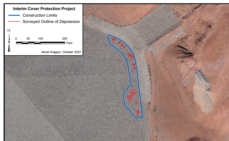
Depression Features on Northeast Side Slope and Approximate Area of Interim Cover Protection Project.

For more information see the site's Disposal Cell Evaluation Information Sheet .