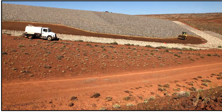
Mexican Hat Interim Cover Protection Project.