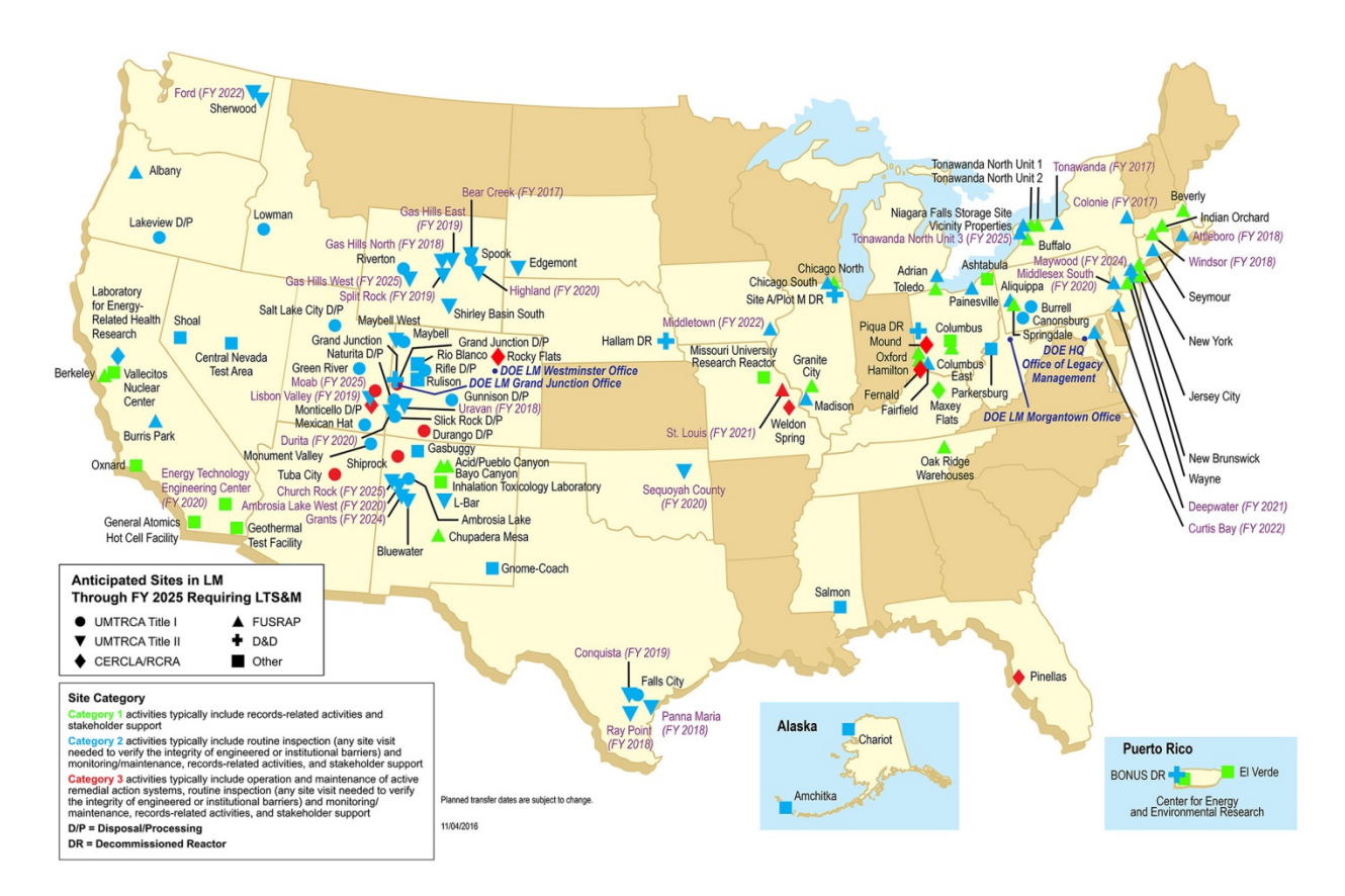
Figure 1. 2016 LM Site Map

As more sites are cleaned up and transitioned over to LM's care, the scope and diversity of its post-closure responsibilities including its interactions with the public will continue to increase over the time. Additionally, with an increased number of retirees from our organization, there is a need to efficiently and quickly orient new staff to the organization. New site managers will have ready access to key information about their sites. All of these conditions set the stage for the application and use of ESRI Story Maps for public engagement and for internal decision making.