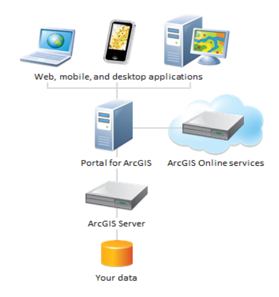
Figure 5. LM's Selected Infrastructure to Support Story Maps<sup>1</sup>

for release a decision is made to release the content to ArcGIS Online and other LM specific platforms, where it will be publicly accessible.