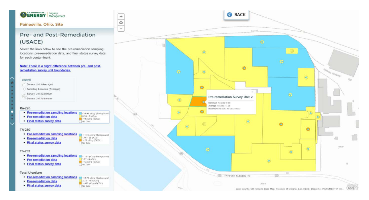
Figure 4. Pre and Post Remediation sampling locations, Painesville Ohio Site