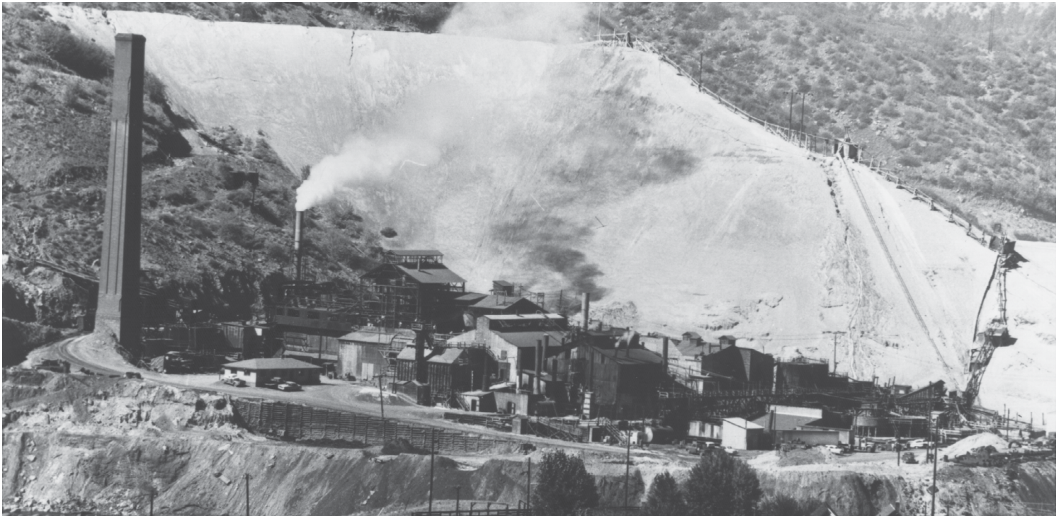
Durango mill during active operations (date unknown). The smokestack for the old lead smelter is to the left, with the large tailings pile and conveyances across the center.