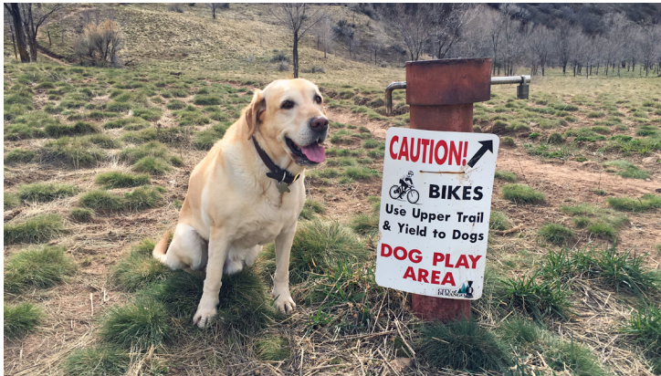
After the Department of Energy (DOE) completed surface cleanup, the city of Durango transitioned the former Durango, Colorado, uranium processing site into a public park and recreation area. As a dog-friendly park, the LM site manager's dog, Drake, is able to join site inspections.

groundwater to verify the continued integrity of the disposal cell. LM makes environmental monitoring data publicly accessible at: https://gems.lm.doe.gov/#site=DUD and https://gems.lm.doe.gov/#site=DUP .