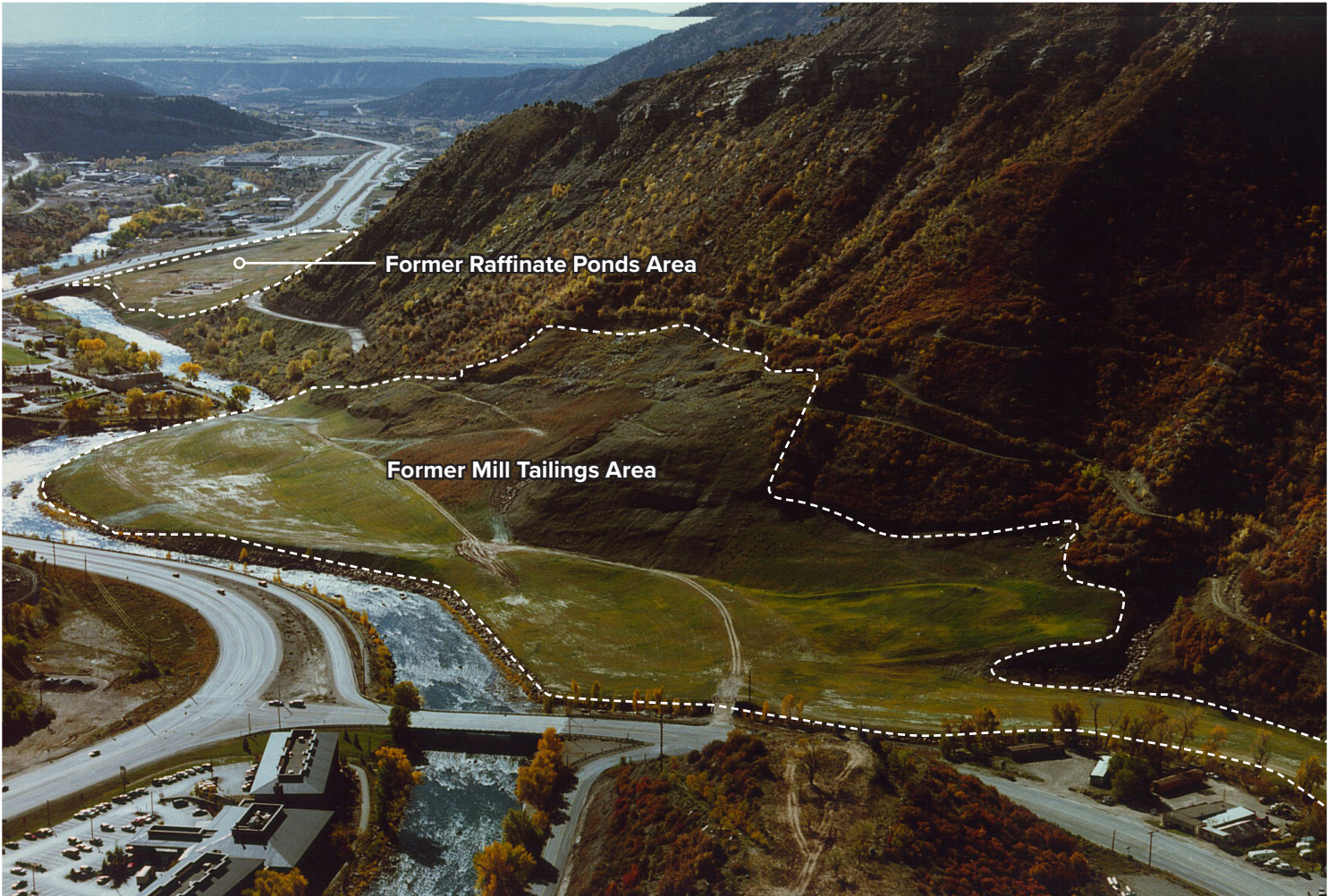
View of Durango, CO, Remediated Processing Site (1991).