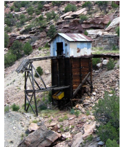
Wild Steer Mine (BLM-administered land).

The Abandoned Uranium Mines Working Group is a consortium of federal agencies working together to address the human health, safety, and environmental challenges posed by the nation's abandoned uranium mines. The working group is led by LM and includes leadership from the U.S. Environmental Protection Agency (EPA), U.S. Bureau of Land Management (BLM), U.S. Forest Service (USFS), Bureau of Indian Affairs, and National Park Service (NPS).