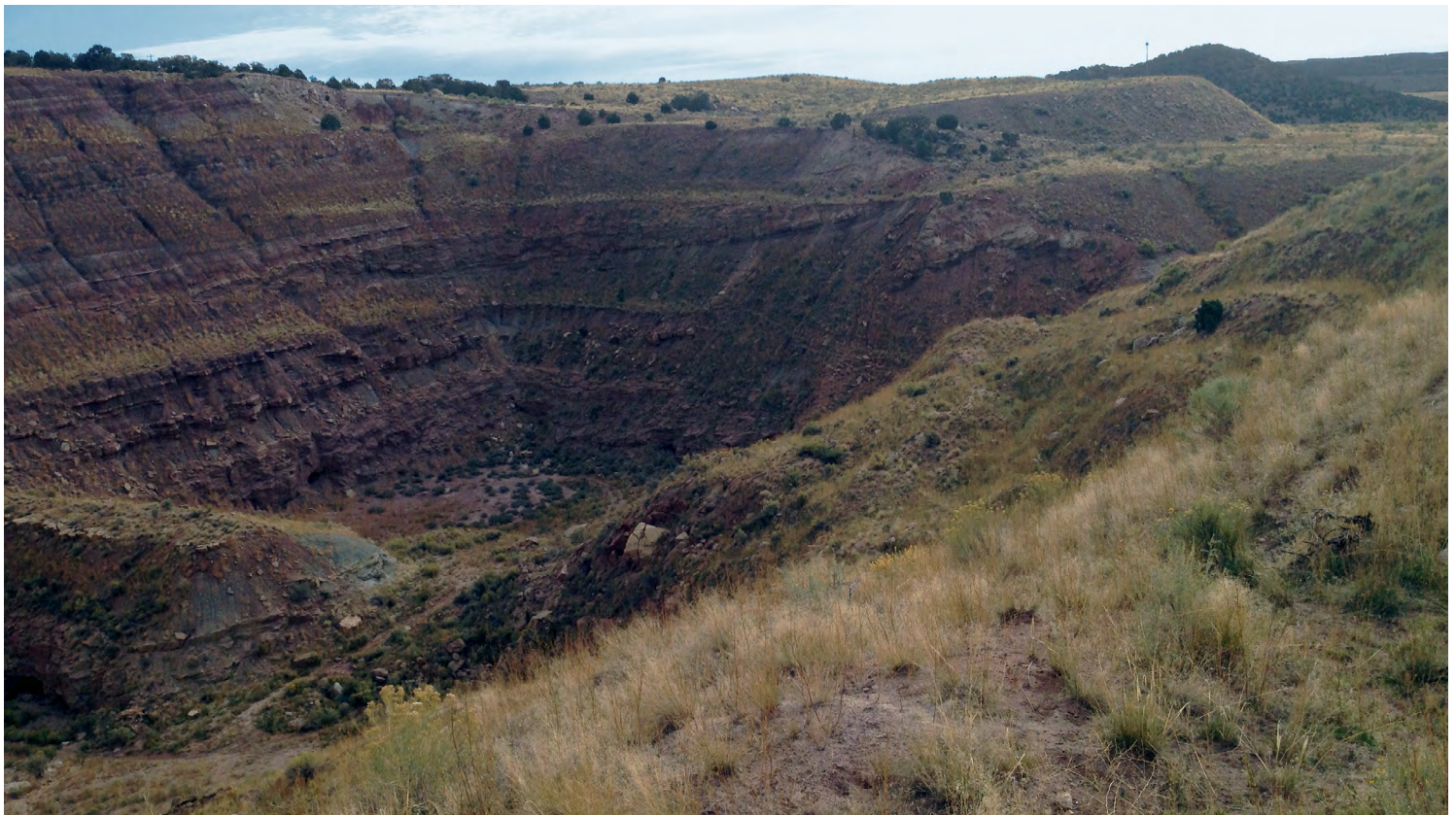
Rattlesnake Open Pit, a Large Mine Located Southeast of Moab, Utah (BLM-administered land).