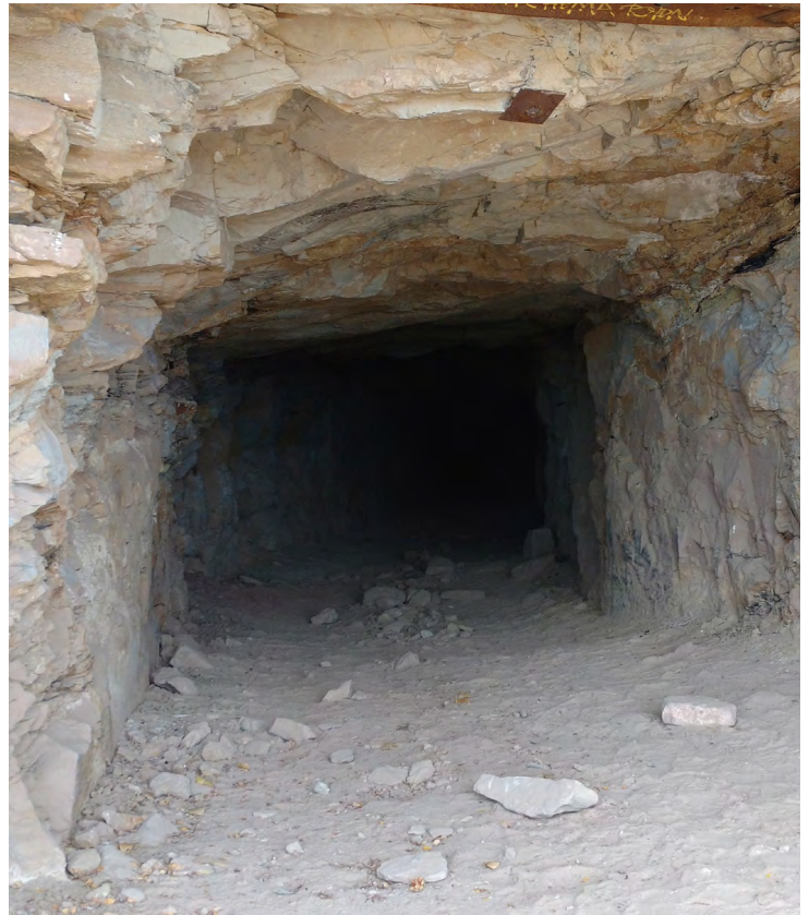
Adit at the Cedar Mine, a Small Mine Located Southeast of Moab, Utah (BLM-administered land).

Field crews implementing the work administered by LM are the backbone of the program. Their efforts support LM in achieving its current goal of evaluating over 2,300 DRUM sites located on public land by the end of CY 2024. LM aims to evaluate all mines on Tribal lands by Sept 30, 2027, and all mines on private land by Sept 30, 2028.