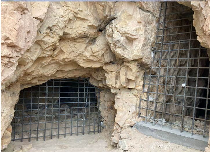
Adits at the Mucho Claims Mine, located southwest of Green River, Utah, before and after safeguarding (BLM-administered land).