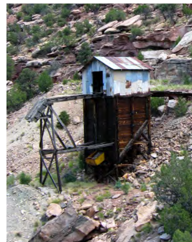
Wild Steer Mine (BLM-administered land).

The Abandoned Uranium Mines Working Group is a consortium of federal agencies working together to address the human health, safety, and environmental challenges posed by the nation's abandoned uranium mines. The working group is led by LM and includes leadership from the U.S. Environmental Protection Agency (EPA), U.S. Bureau of Land Management (BLM), U.S. Forest Service (USFS), Bureau of Indian Affairs, and National Park Service (NPS).