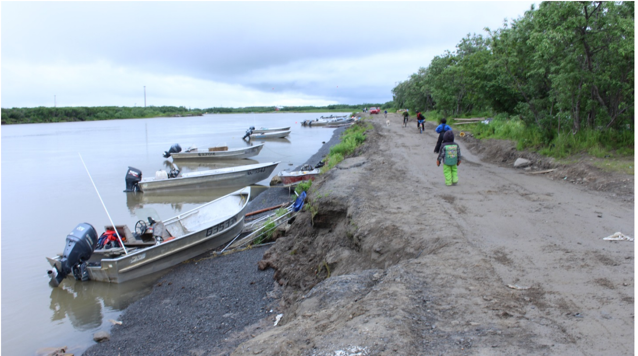
Photos of boats along the eroding shoreline in Alakanuk, AK

Vision Statement “Coming together to educate our community to conserve energy and to identify other cost saving alternative energy resources for the future generations”