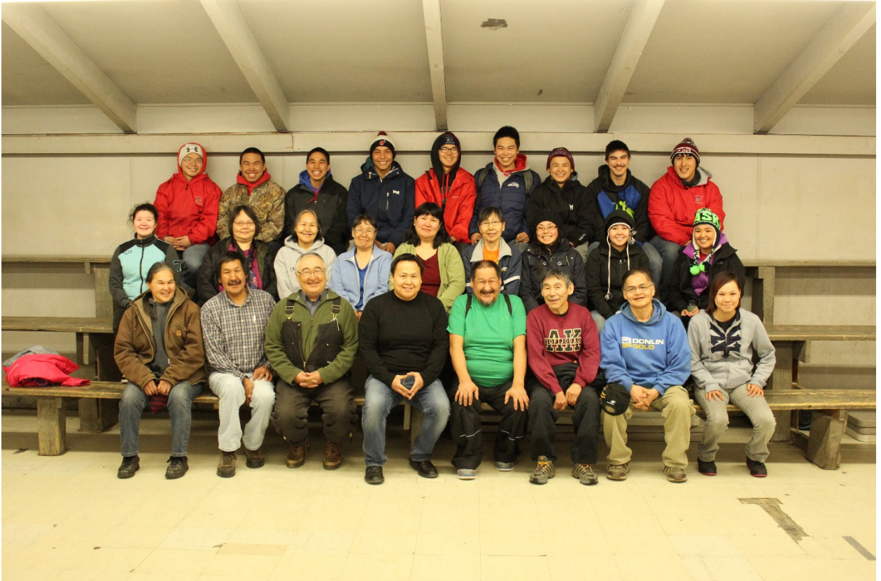
Photo of Emmonak Community Energy Planning Participants

Vision Statement “We the community of Emmonak will build our own capacity through energy education and training, to continue utilizing and seeking renewable energy, and pursuing community upgrades for our present and future generations”