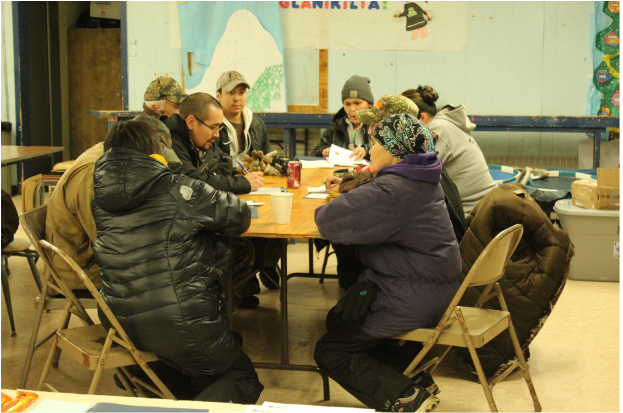
Break-out session during the Kotlik Community Energy Planning Workshop

Vision Statement “We the people of Kotlik being placed here by our creator pledge to work together to find the best possible solutions to educate and reduce the need of fossil fuels. Also, to help protect our environment by adding the lowest cost of alternative energy and focus to weatherize residential and commercial buildings to become 5 star energy efficient”