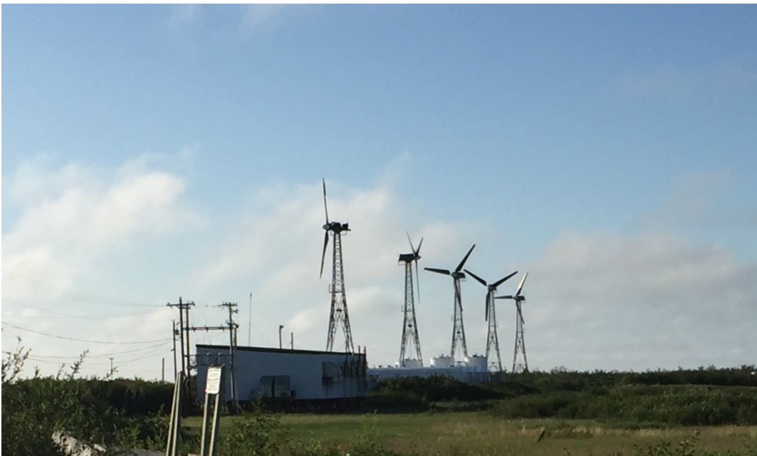
Tuntutuliak, AK - Five installed 95kW wind turbines as part of the Chaninik Wind Group

Vision Statement “To increase use of renewable energy and alternative heating to ensure a more energy efficiency community for both residential and commercial benefit and to educate the community and future generations to practice more energy efficient methods”