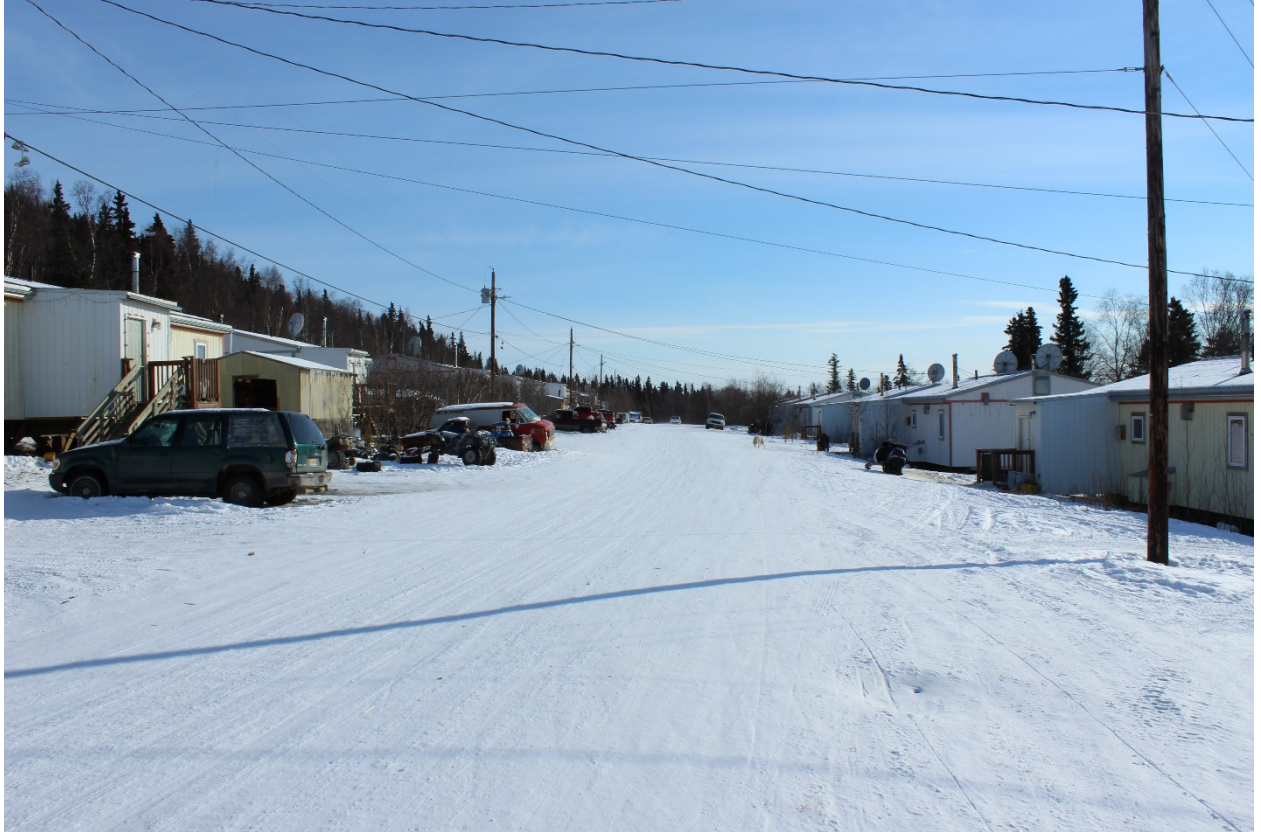
Homes in Kalskag, AK

Vision: Developing Sustainable and Affordable Energy Resources for the People of Kalskag