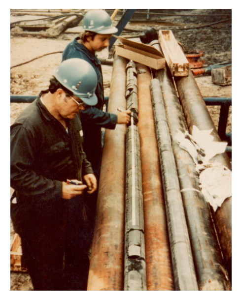
DOE researchers gathering data from one of a series of cored shale wells in the Appalachian Basin in the early 1980s.