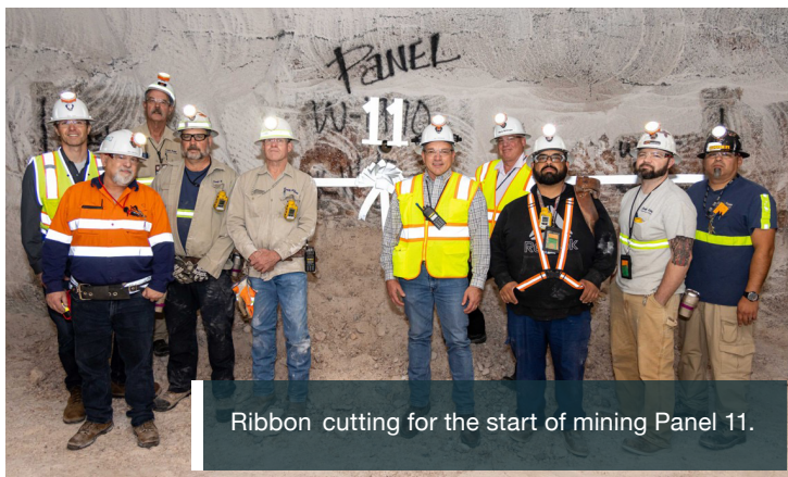
Ribbon cutting for the start of mining Panel 11.

A number of diverse Tribes and stakeholder groups closely monitor all aspects of WIPP and the National TRU Program. WIPP has pursued significant engagement with stakeholders across New Mexico with an interest in WIPP events, progress, and the role WIPP has in the overall cleanup of the DOE complex. WIPP engages routinely with state and federal regulators, and advocacy groups that tend to serve a watchdog role in their interest in WIPP. DOE provides technical, training, logistical, and funding support to six Tribal Nations and state regional groups that focus on the safe transport