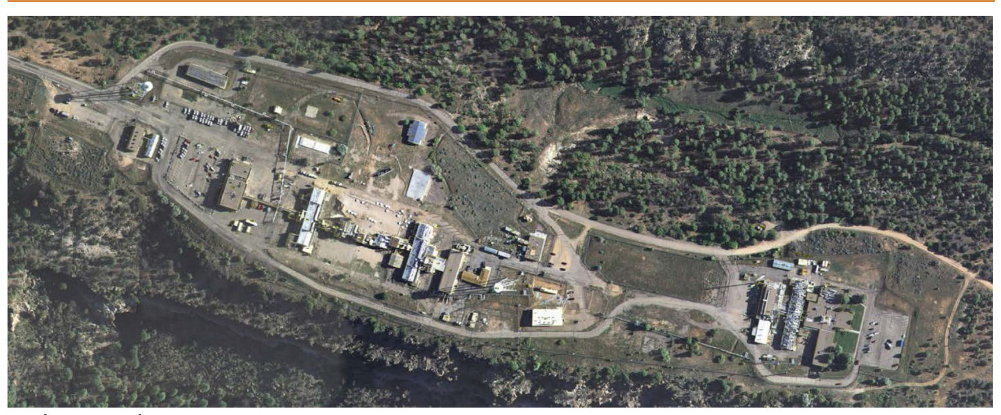
During operating years