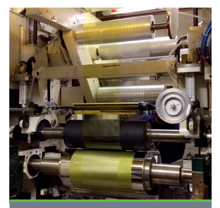
Roll-to-roll coating of perovskite ink at 100 ft/min on a polyethylene terephthalate substrate previously coated with indium tin oxide and a hole transport material.

• Photovoltaic Research and Development (PVRD and PVRD2) – Both programs focus on advancing current and emerging technologies that can improve power