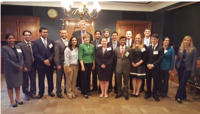
Senator Shaheen and AMO Director Mark Johnson with a group of current and former IAC students at the 40 th anniversary celebration

A tireless champion for the IACs mission to help small and medium-sized manufacturers save energy, reduce waste and water use, and improve productivity, Senator Shaheen praised the successes of IAC directors and students alike, stating “university teams under the IAC program have conducted more than 17,000 energy assessments at U.S. manufacturing plants nationwide, helping to save enough energy to power 1.4 million homes. Moreover, IACs have saved participating manufacturers more than $1 billion in energy costs. An estimated 6 million metric tons of carbon dioxide emissions have been avoided due to IAC assessments, which is equivalent to the emissions from more than 1.2 million cars.”