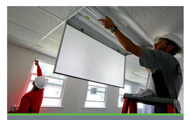
Workers install an efficient lighting system.