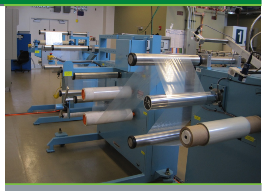
Figure 1. Industrial-style roll-to-roll web-line at the National Renewable Energy Laboratory. The web-line is used to develop and validate in-line inspection methods for fuel cell components, including membranes, electrodes, and gas diffusion media.

The ramp-up to high-volume production of fuel cells will require quality control