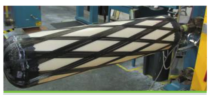
Figure 3. Example of a hydrogen storage pressure vessel showing forward and aft dome caps that were filament wound during the manufacturing process.

Figure 2. Example of infrared thermographic detection of gas diffusion media defects (surface scratches) using direct current excitation. The sample is shown on the left and the detected thermal response, with the material moving at 30 feet per minute, is shown on the right.