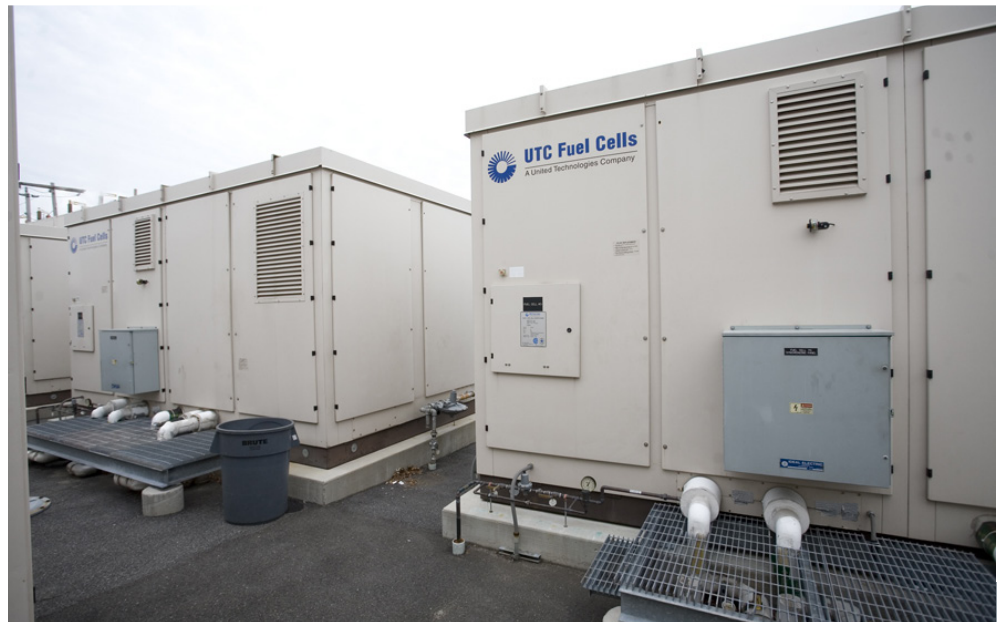
A fuel cell CHP system provides primary power, heating, and cooling for Verizon's Central Office.

Verizon's Central Office in Garden City, New York, is a 1,000-employee, 292,000 sq ft call-switching center that provides telecommunications support and service to 35,000 customers throughout Long Island, as well as to nearby international airports, JFK and LaGuardia, and to