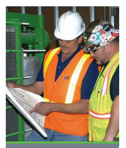
Personnel from Marine Corps Logistics Base Albany and a DOE ESCO review plans to install a 1.9 MW methane power generator as part of an ESPC project.