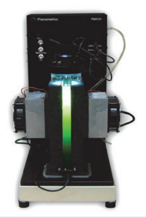
An environmental photobioreactor