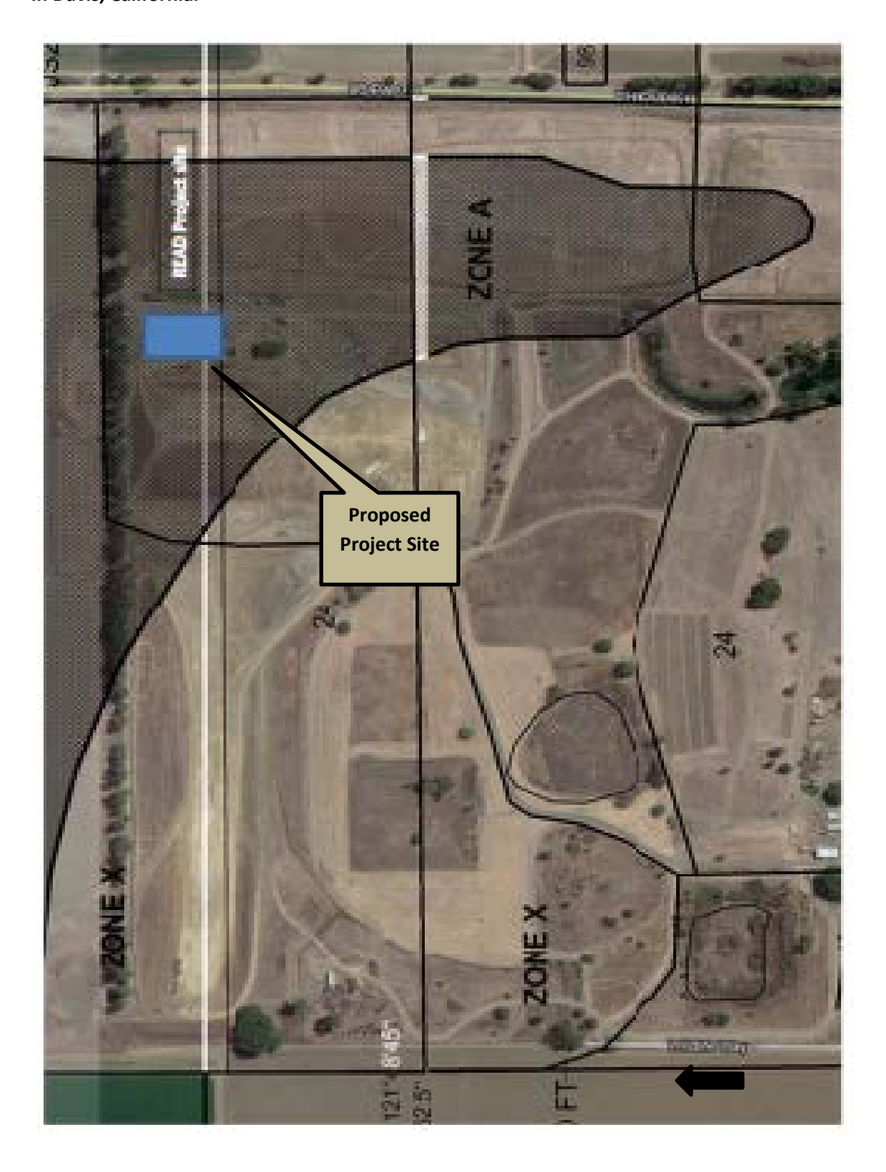
Figure A: Location of the proposed project site within the 100-year floodplain on the UC Davis campus in Davis, California.