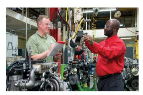
To achieve corporate energy reduction goals, Cummins Inc.'s natural gas and diesel engine manufacturing facility in Rocky Mount, North Carolina, implemented an energy management system that earned the plant both ISO 50001 and Gold Superior Energy Performance certifications.

Cummins Inc.—a global engine manufacturer—worked with the U.S. Department of Energy (DOE) Advanced Manufacturing Office to successfully implement an energy management system (EnMS) that meets all requirements of ISO 50001¹ and Superior Energy Performance® (SEP™). Cummins' implementation of the EnMS at its Rocky Mount Engine Plant (RMEP) in Rocky Mount, North Carolina, enabled a 12.6% improvement in energy performance, saving over $700,000 a year.