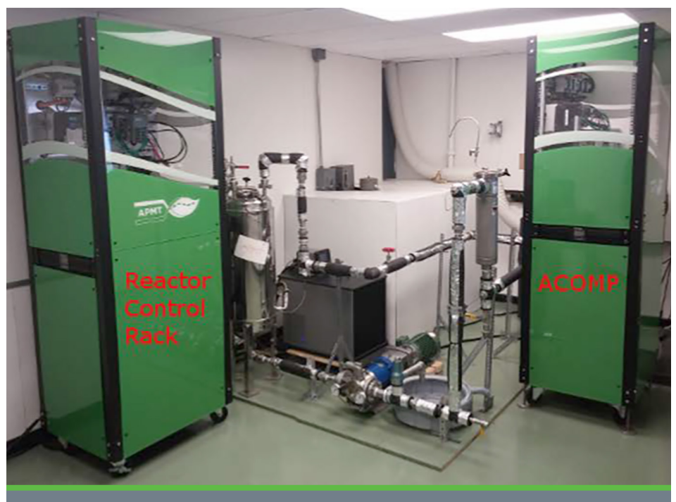
Figure 1. Researchers developed basic control and automation technology using the laboratory scale Automatic Continuous Online Monitoring of Polymerization reactions/ Control Interface (ACOMP/CI) system. The technology was validated using the ACOMP/CI pilot system with 64L reactor shown above.

Despite the important role of polymers, due to the complexity of characterizing polymers, the design and implementation of polymer reactors is still an art rather than a science relying on operator judgment and reaction 'recipes.' Most polymer processes utilize timeconsuming and labor-intensive offline analyses to validate, perform quality control, and provide some level of process control. Major problems can also occur during reactions, for example, runaway and dangerously exothermic reactions, failed reactions, production of unwanted side products, and reactor