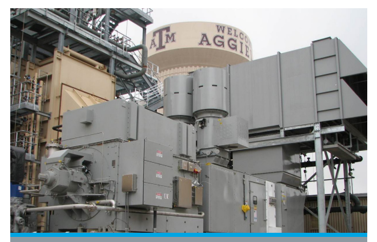
Texas A&M University installed a natural-gas fired CHP system at its College Station campus in 2011.

The CHP system can operate as a baseload system to serve 75% of Texas A&M's peak power needs, 65% of total electrical energy needs, and 80% of the heating loads (steam for cooling included).