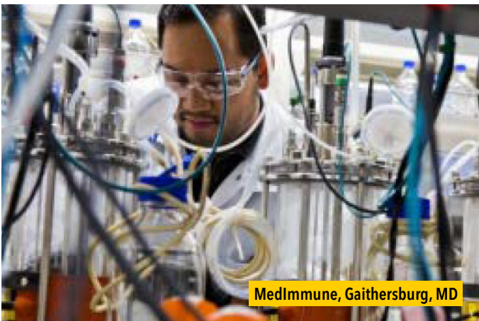
MedImmune, Gaithersburg, MD

MedImmune [Gaithersburg, MD] achieved recertification to ISO 50001 and SEP in August 2017, improving its energy performance by another 8.9% over 3 years, on top of similar savings achieved during its initial certification in 2014. Read more >>