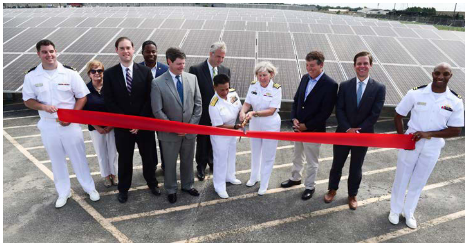
Figure 2. The ribbon-cutting ceremony for NCBC Gulfport’s 13,000-module solar facility, which began sending electrons to the grid in early 2017.

For questions about UESC technical assistance, contact Tracy Niro at 202-431-7601 or Tracy.Niro@ee.doe.gov . ■