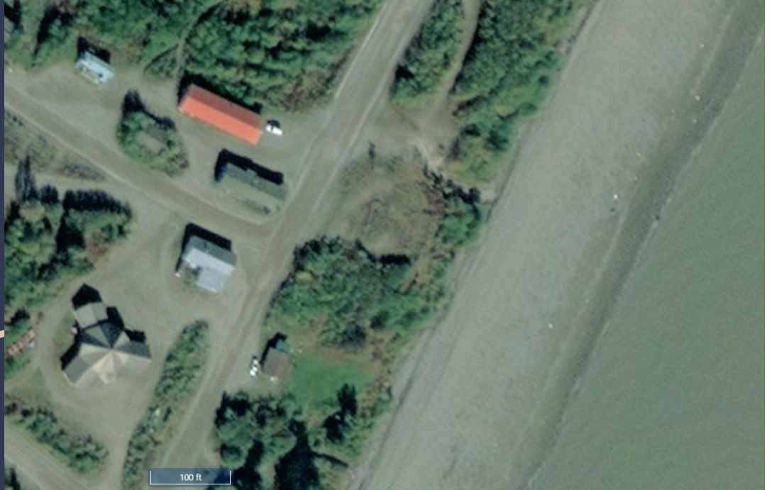
Image from mapper.dnr.alaska.gov > layers > AK RGB high resolution