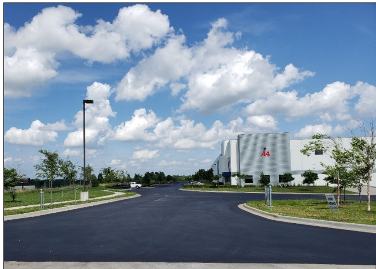
Photograph 1: North driveway and northwest corner of building, facing east