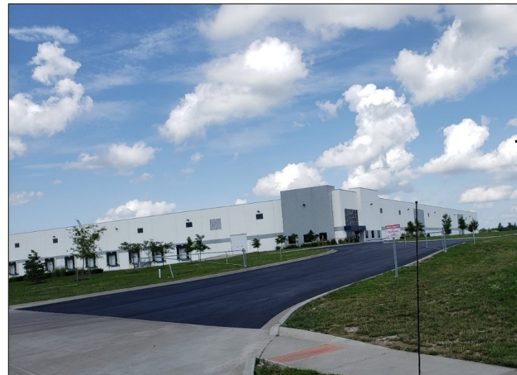
Photograph 2: South driveway and southwest corner of building, facing east-northeast