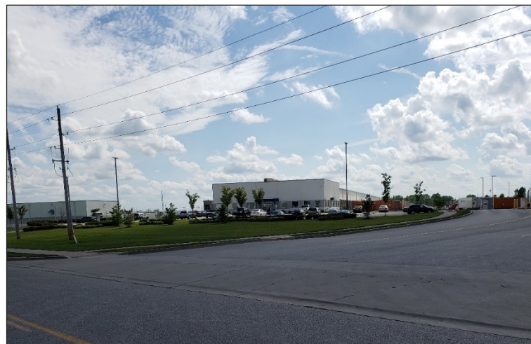
Photograph 3: Distribution facility across Andrews Road from Building 23, facing southwest