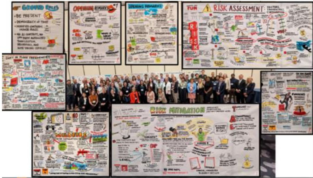
Included in the photo above are notes from the cohort workshop that were drawn (in real time) by an artist with a cybersecurity background.