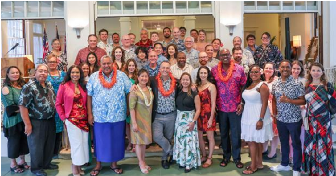
The NGA Roundtable on Energy Resilience and Security kicked off with governors' representatives from all U.S. territories and islands.