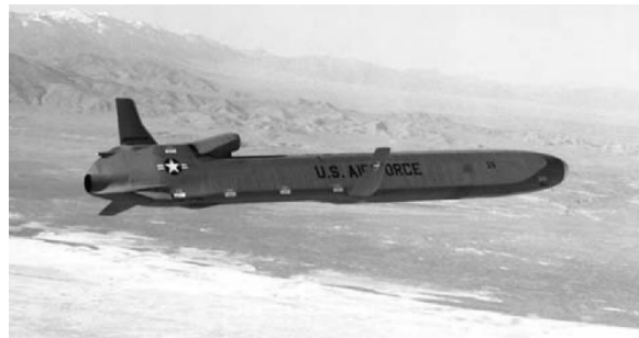
W80 warhead and its delivery system, the Air Launched Cruise Missile