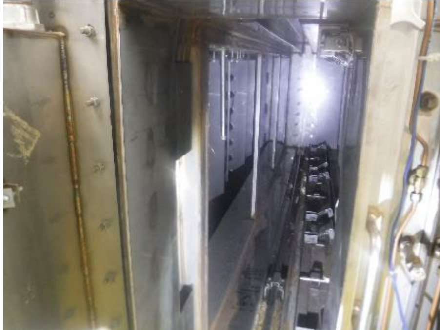
South Upper Roughing Filter Chamber