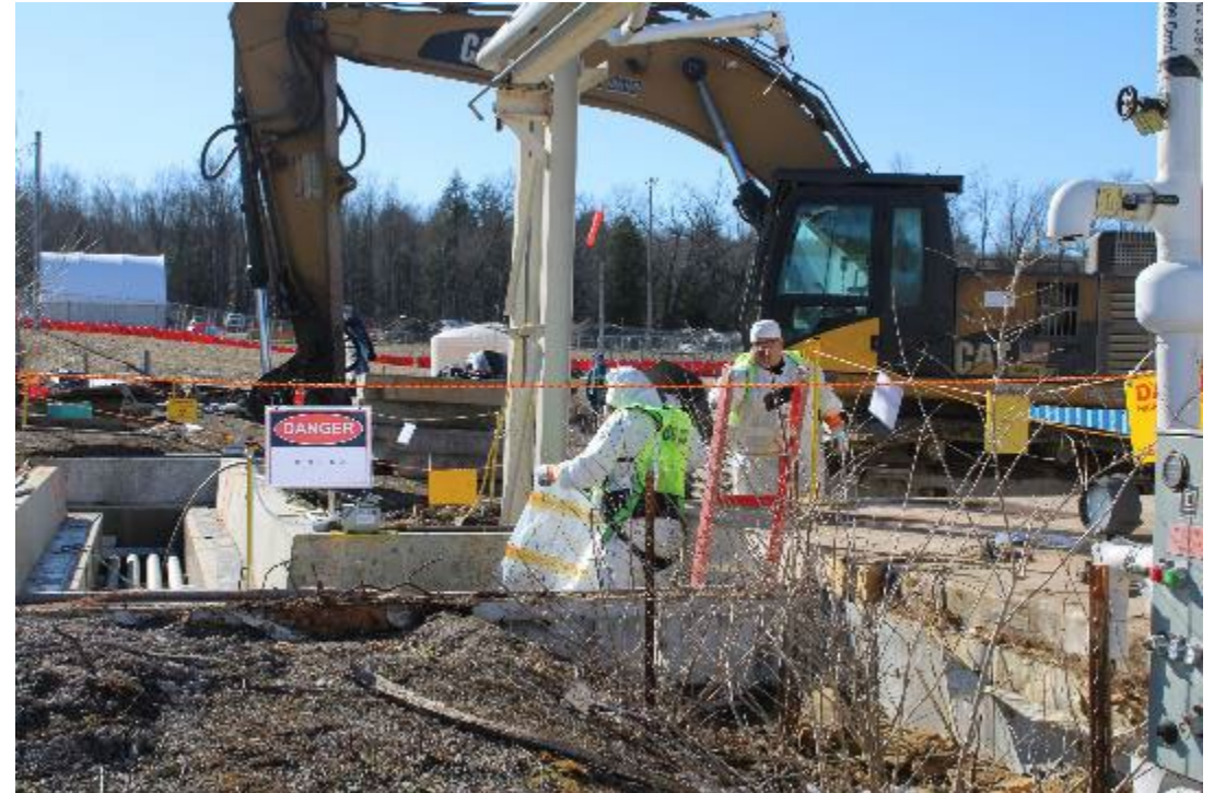
Pipe cutting with support outside work area

All piping removed, packaged, and trench covered with concrete lids and a sealant