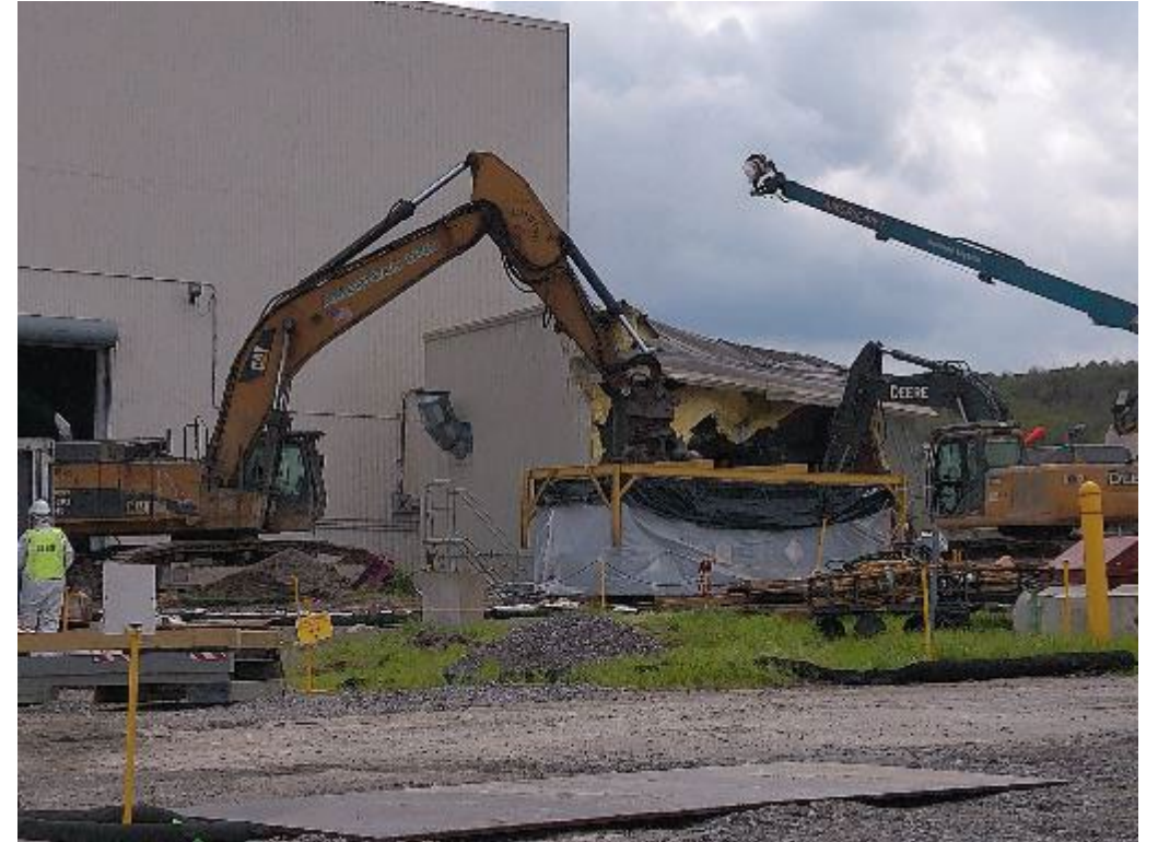
Demolition of RVU Building