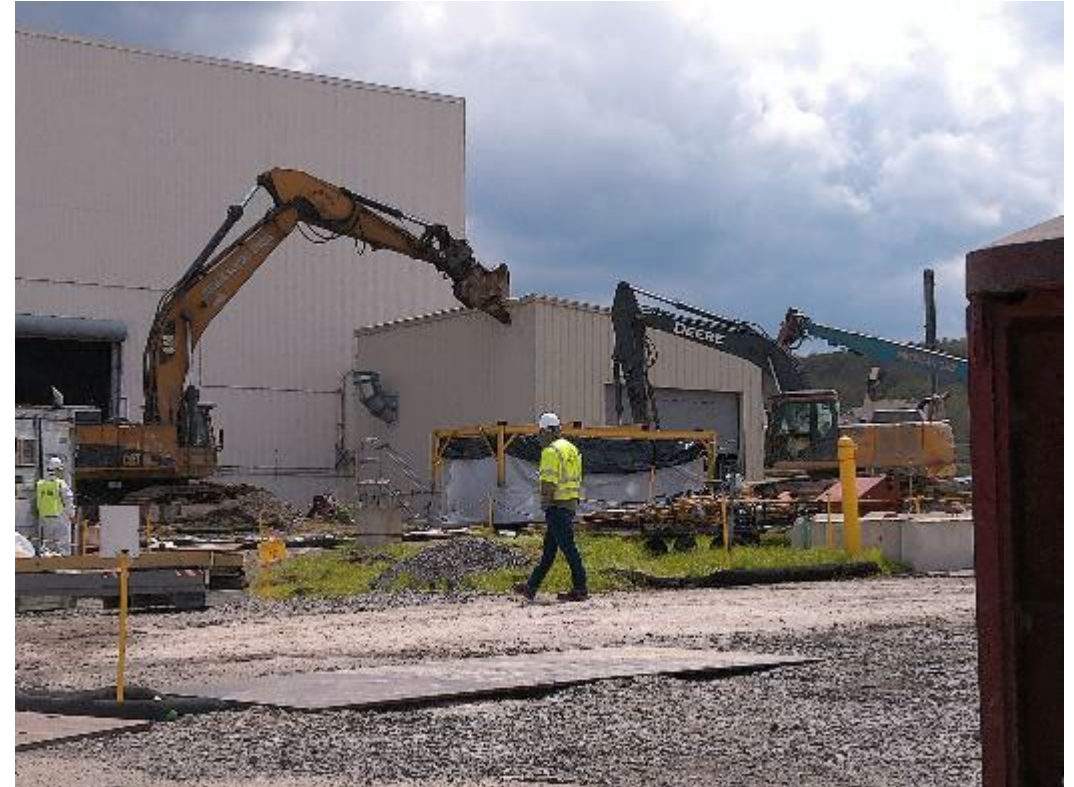
“First Bite” on the demolition of the RVU Building