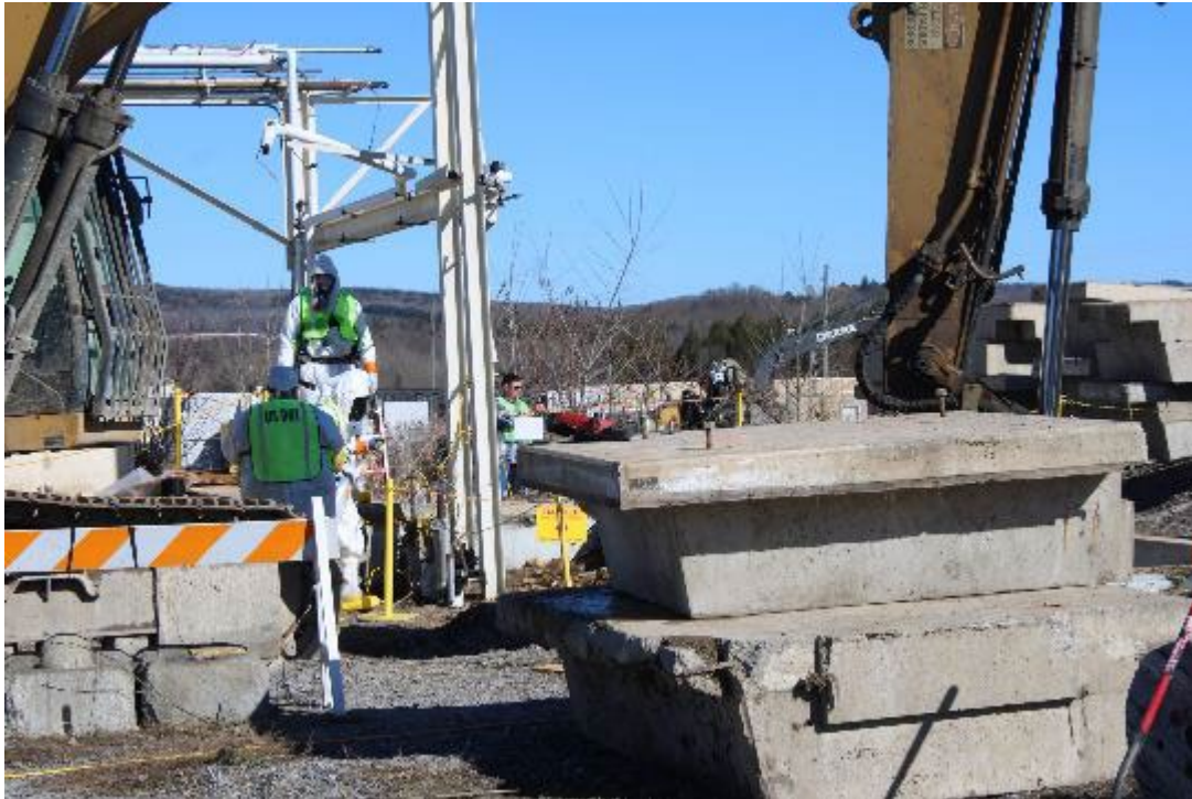
HLW Pipe Trench removal operations