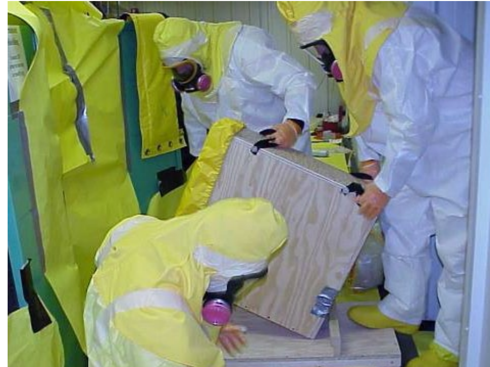
Workers remove lower filter into a box (Cart used for transferring filter box)

Roughing Filters – removes larger particulates from the air