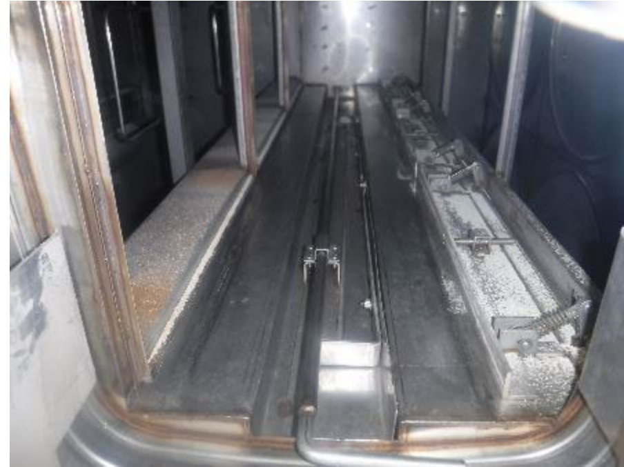
Second Bank HEPA Filter

COMPLETED: All 12 roughing filters and 24 high-efficiency particulate air filters removed and replaced