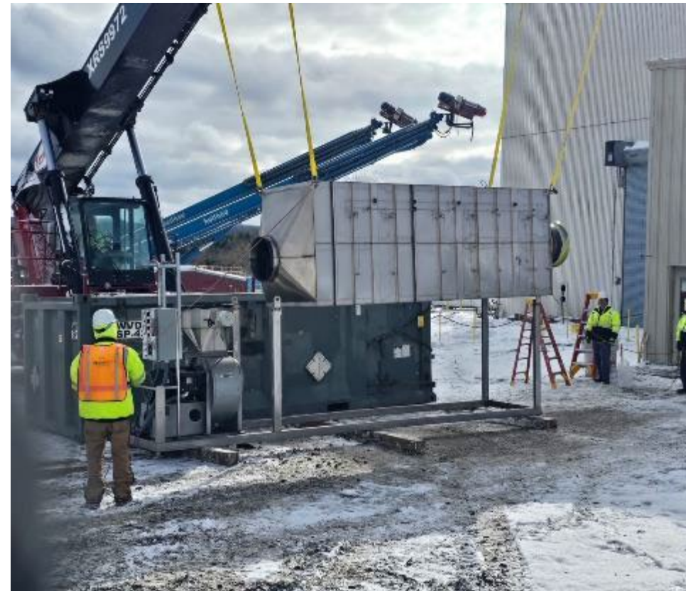
Loading the first RVU into a waste container