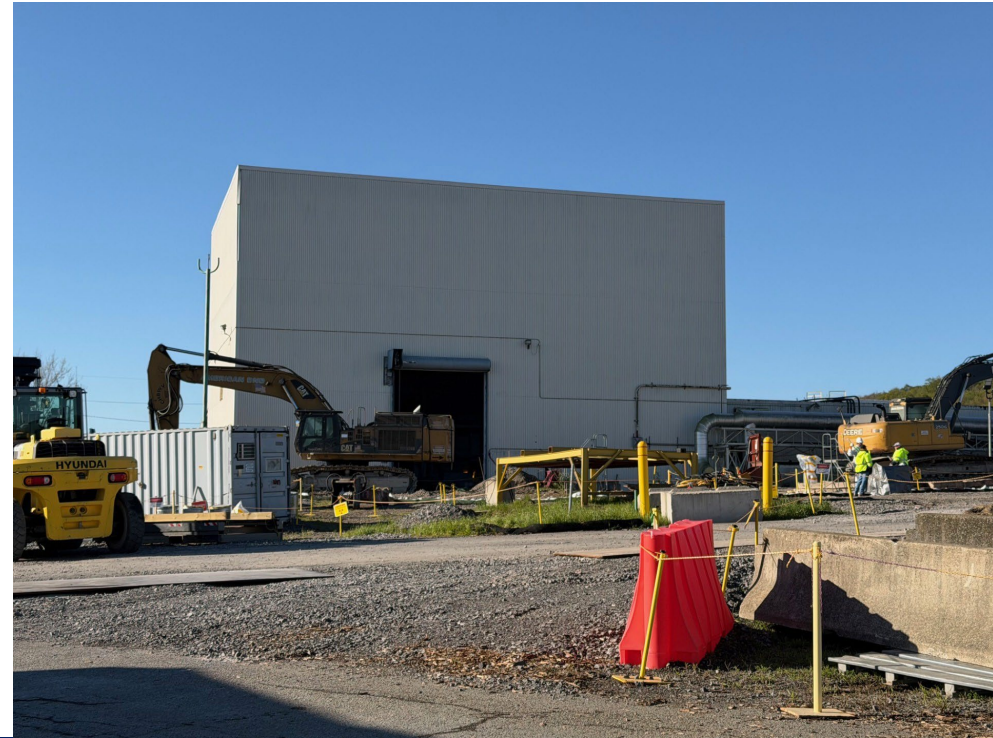
Before and After RVU Building Demolition