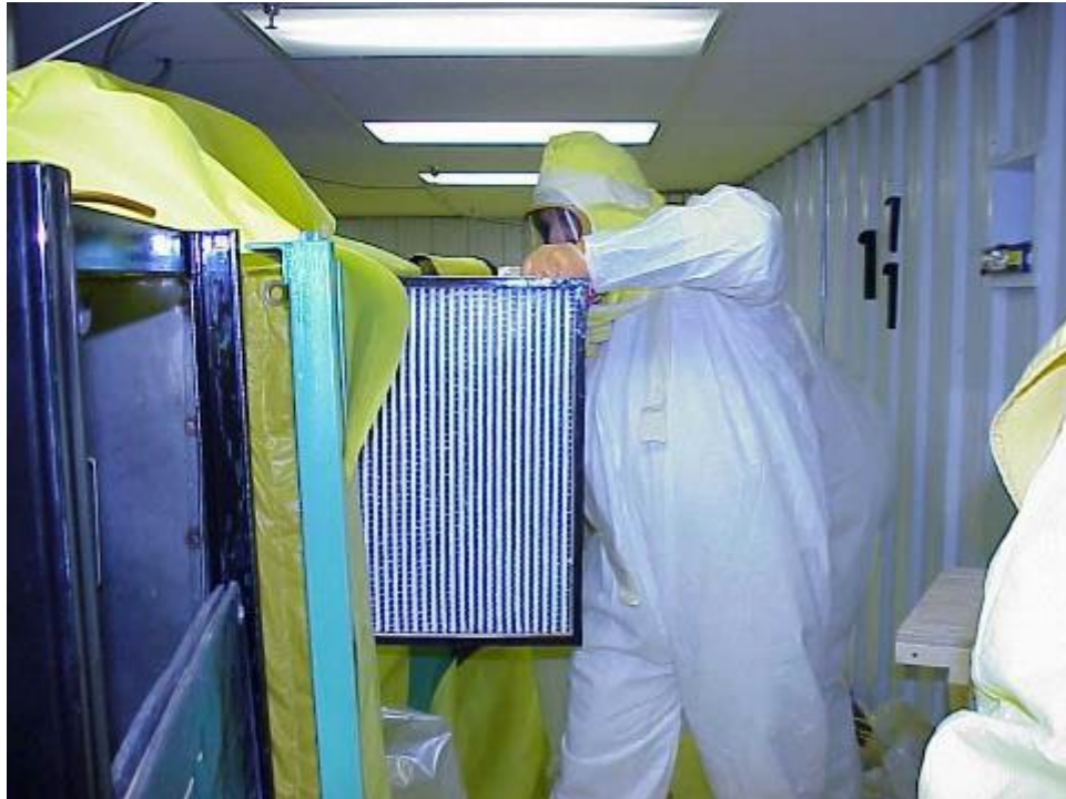
Removal of a South Roughing Filter