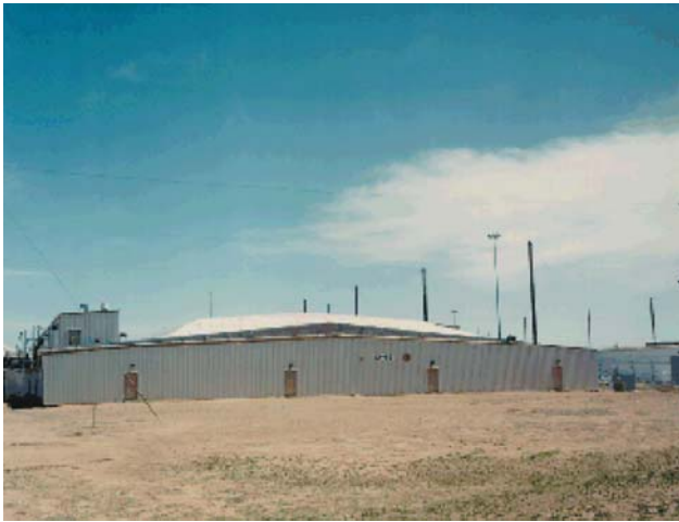
Nuclear Operations Facility

are properly labeled and tracked. In addition, specific controls for waste management have been imbedded within nuclear explosive operating procedures.