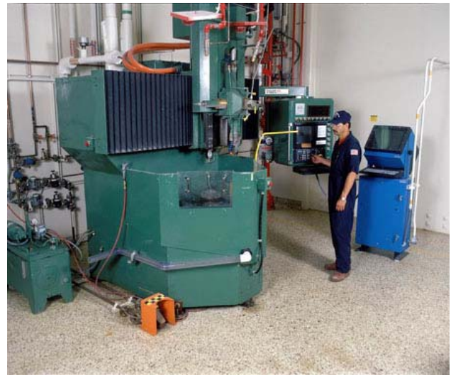
High Explosives Fabrication Activities

Volume II of this report provides four technical appendices (C through F) containing detailed results of the OA review. Appendix C provides the results of the review of the application of the core functions of ISM for Pantex Plant work activities. Appendix D presents the results of the review of NNSA, PXSO, and BWXT