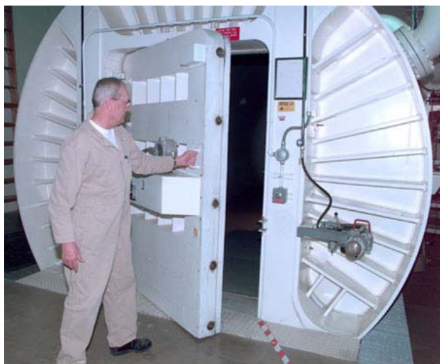
Isolation Door at the Pantex Plant

analytical basis for some important controls, such as the leak rate and closure time for the blast valves. Furthermore, BWXT has not established appropriate processes for controlling engineering calculations, which contributed to weaknesses (lack of rigor and quality) and analytical errors in several calculations and an engineering evaluation. In addition, although improvements have been made in some areas of configuration management, weaknesses exist in the unreviewed safety question procedure and in the issues tracking process, particularly in the areas of processing new information that may impact the safety basis and in implementing the issues reporting system to formally identify and track engineering issues. Finally, BWXT has not established an effective process for tracking and trending safety system performance.