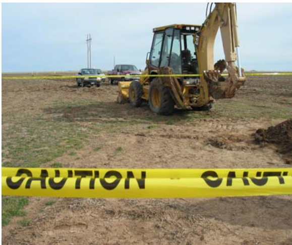
Pantex Excavation Strike

Processes for performing activity-level hazards analysis, conducting exposure assessments, and ensuring that hazard controls are established and communicated to workers are not sufficiently effective to ensure that workers are protected against the full range of potential hazards. With the exception of nuclear explosive and explosive hazards, BWXT management has not assured that hazards are analyzed and documented and that controls are specified for work activities prior to