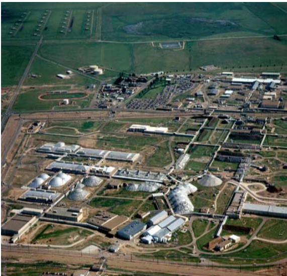
Aerial View of the Pantex Plant

The U.S. Department of Energy (DOE) Office of Independent Oversight and Performance Assurance (OA) conducted an inspection of environment, safety, and health (ES&H) programs at the DOE Pantex Plant during January and February 2005. The inspection was performed by the OA Office of Environment, Safety and Health Evaluations. OA reports to the Director of the Office of Security and Safety Performance Assurance, who reports directly to the Secretary of Energy.