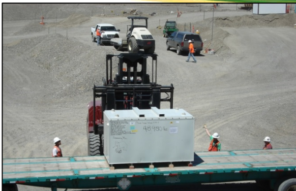
White Elephant Cask Co 60 Jul. 2011