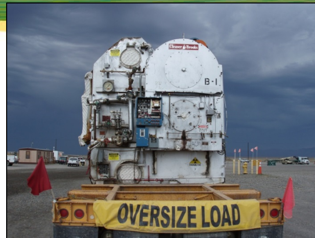
Tan 603 Boiler Aug. 2007