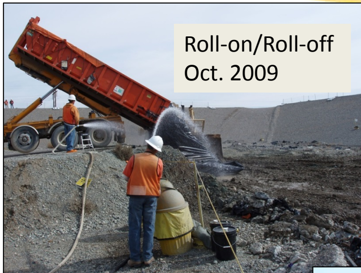
Roll-on/Roll-off Oct. 2009