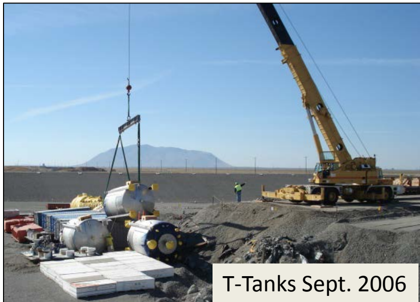
T-Tanks Sept. 2006