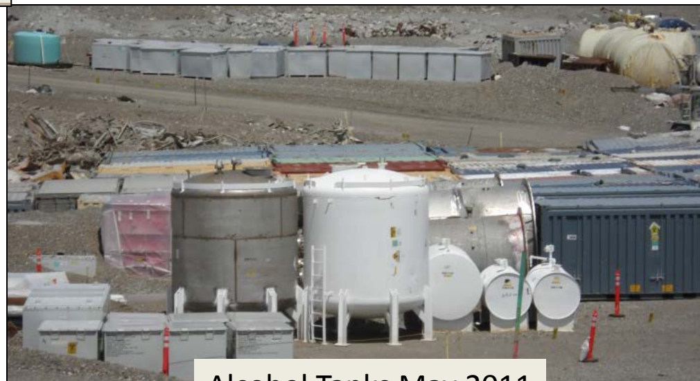
Alcohol Tanks May 2011