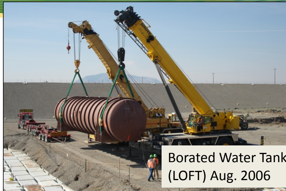
Borated Water Tank (LOFT) Aug. 2006