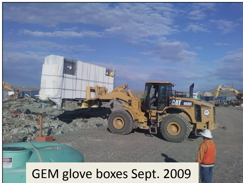
GEM glove boxes Sept. 2009