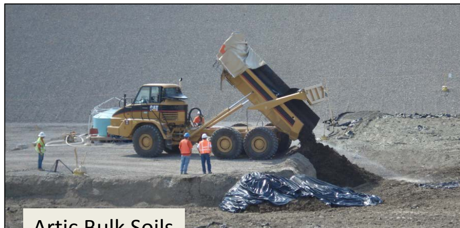
Artic Bulk Soils Aug. 2006