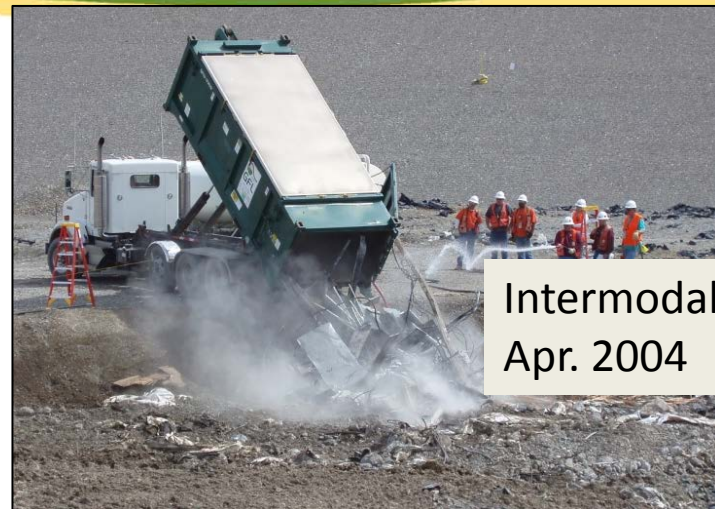
Intermodal Apr. 2004