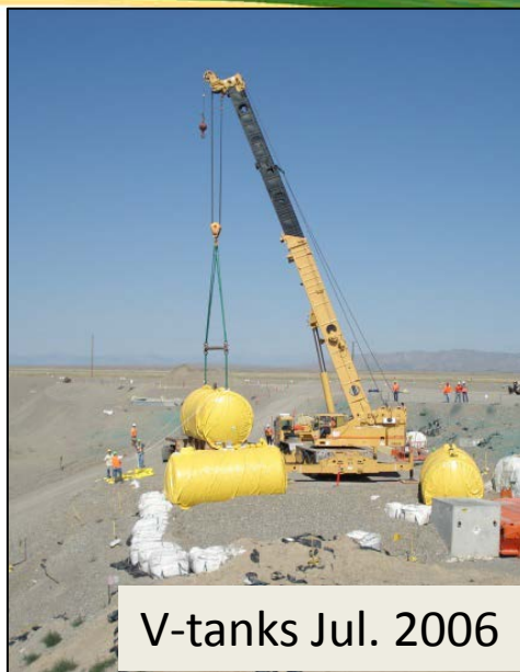
V-tanks Jul. 2006