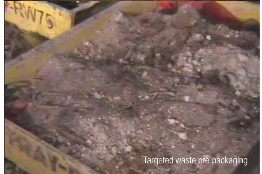
Targeted waste pre-packaging