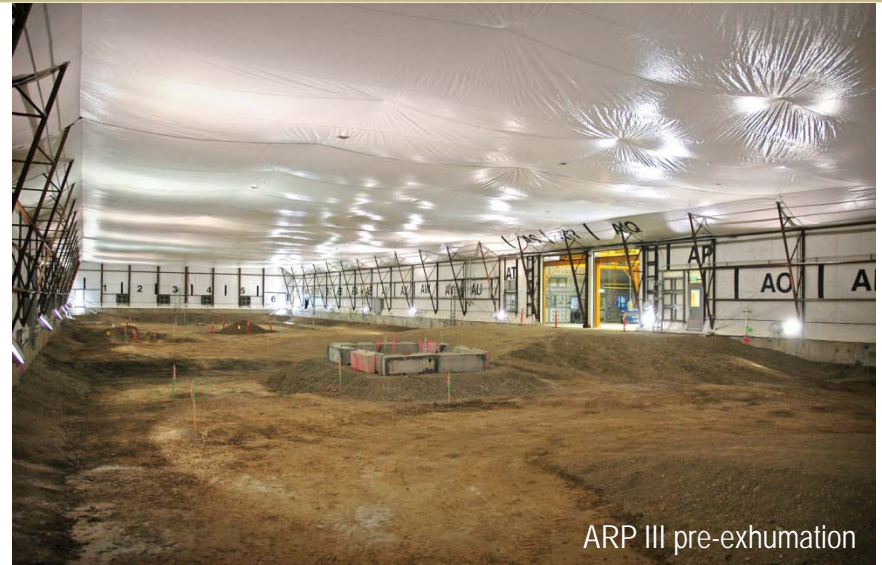
ARP III pre-exhumation