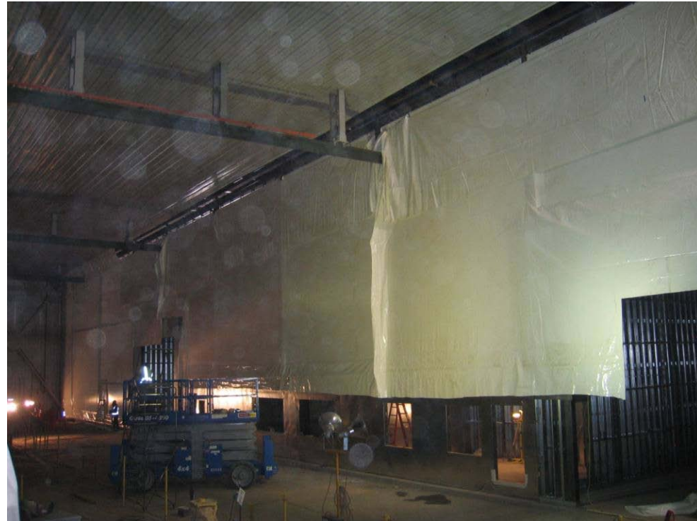
North wall under construction