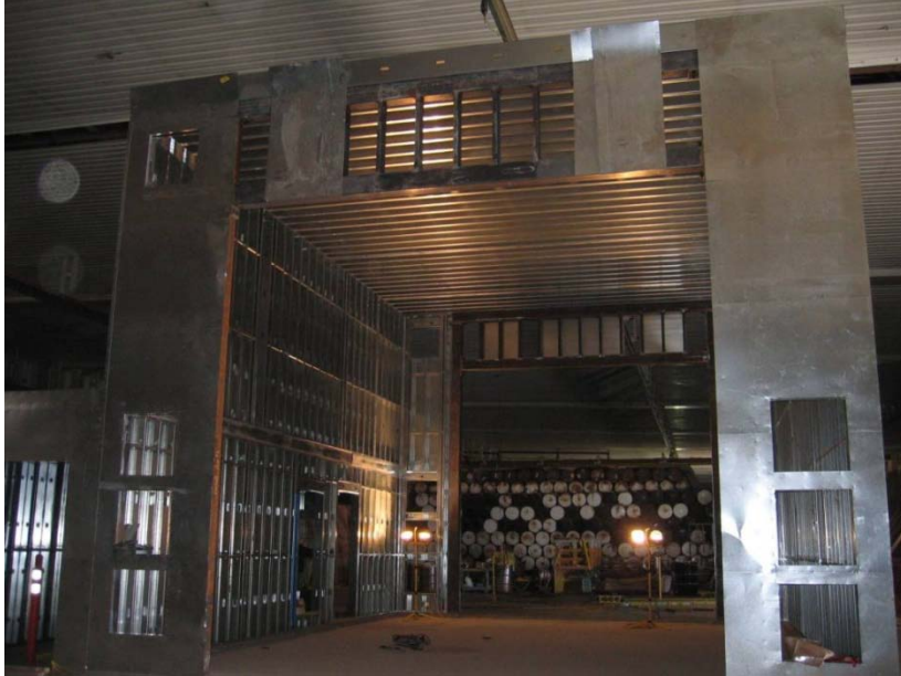
View of airlock under construction