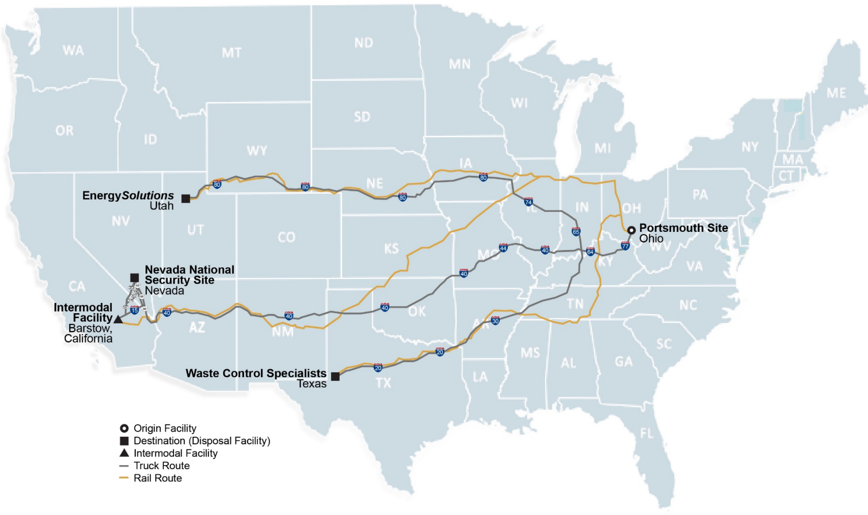
Figure B-3 Analyzed Train and Truck Routes from Portsmouth to Potential Disposal Sites