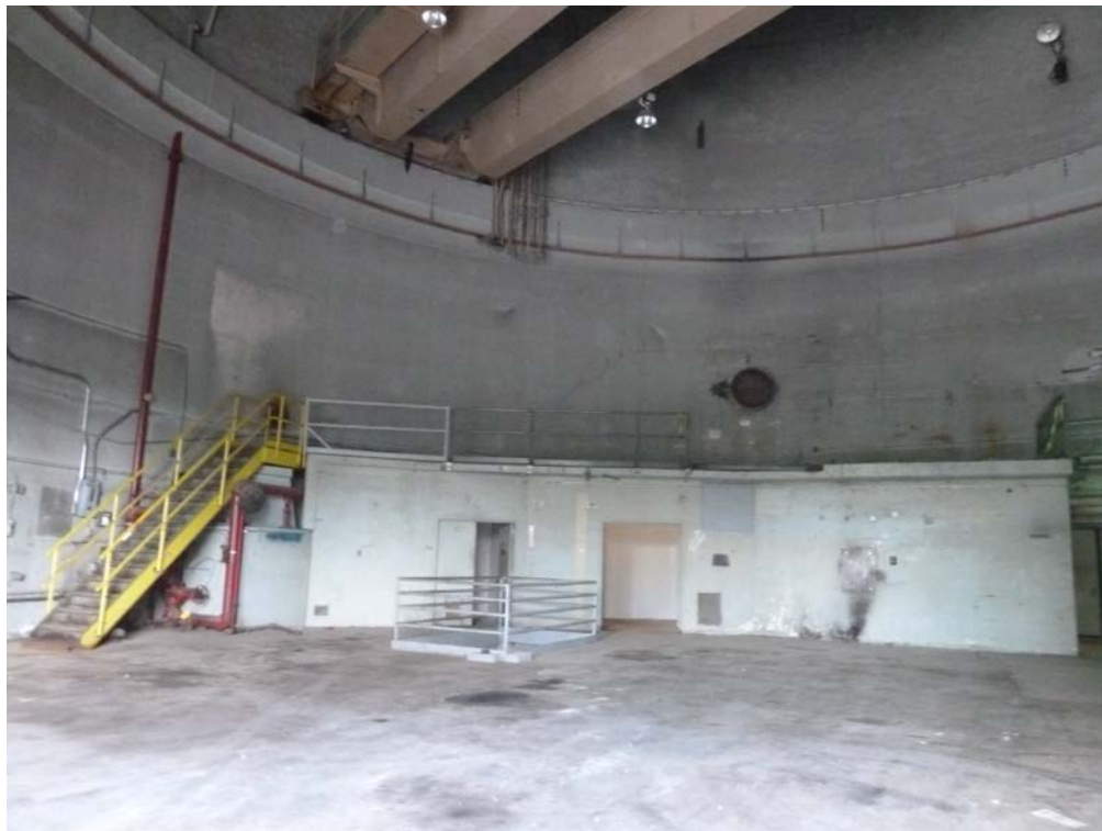
Photo 4. Platform within interior of aboveground containment dome. Chemicals were previously stored under platform.