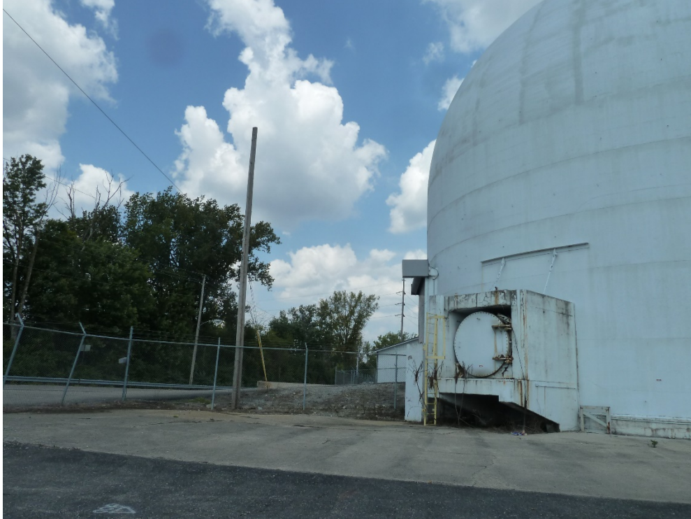
Photo 1. Exterior of aboveground steel containment dome showing barbed wire fence providing security for the site. On other side of containment dome is a secure, motorized, sliding access gate.