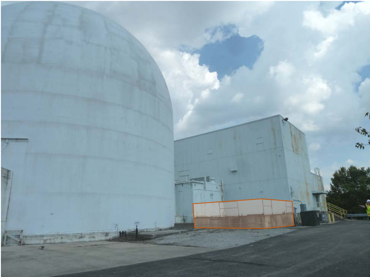
Photo 7. Steel containment dome above the belowground entombment in left of frame. Administration building shown in right of frame. Building between the containment dome and the administration building is an outdoor locker previously used for chemical storage. The concrete pad adjacent to the outdoor locker (indicated with orange outline and tint) may contain PCBs due to previous storage of equipment and fuels.