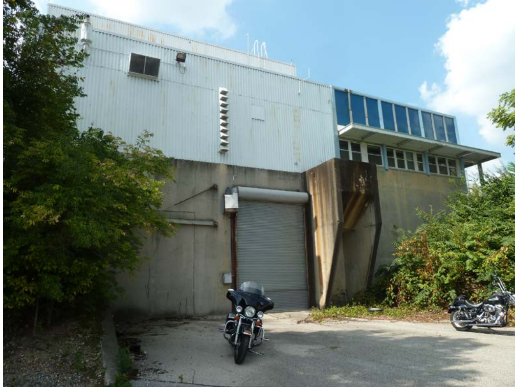
Photo 8. Eastern side of administration building. Blue panels between windows in right side of frame contain asbestos.