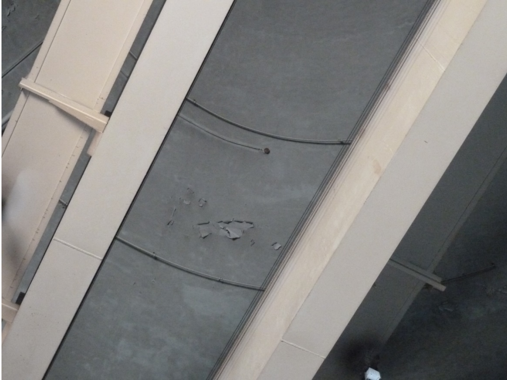
Photo 3. Close-up of flaking LBP containing PCBs on the ceiling of the aboveground containment dome.