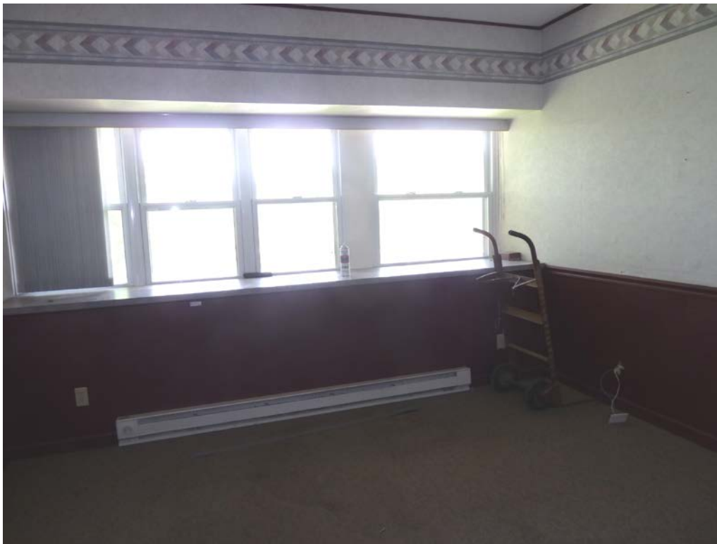
Photo 15. One of three offices in the administration building.