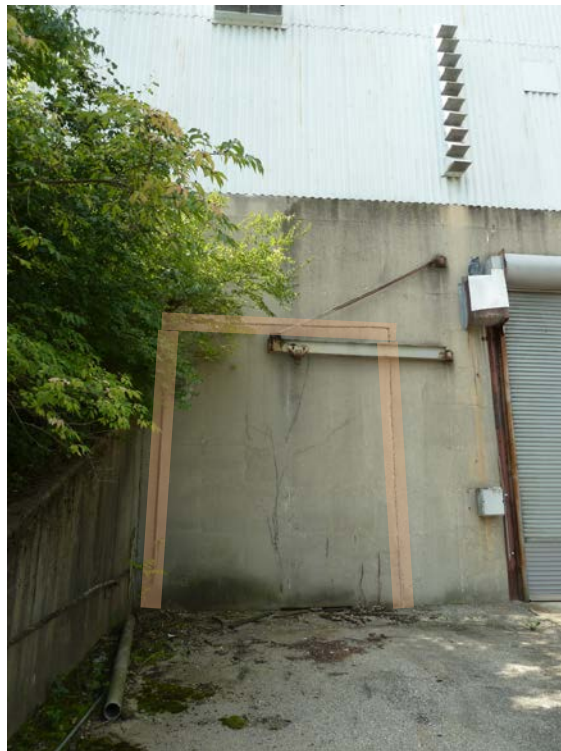
Photo 9. Caulk/epoxy, which may contain asbestos, within the seam of the concrete on the eastern side of the administration building (indicated with transparent orange coloration).