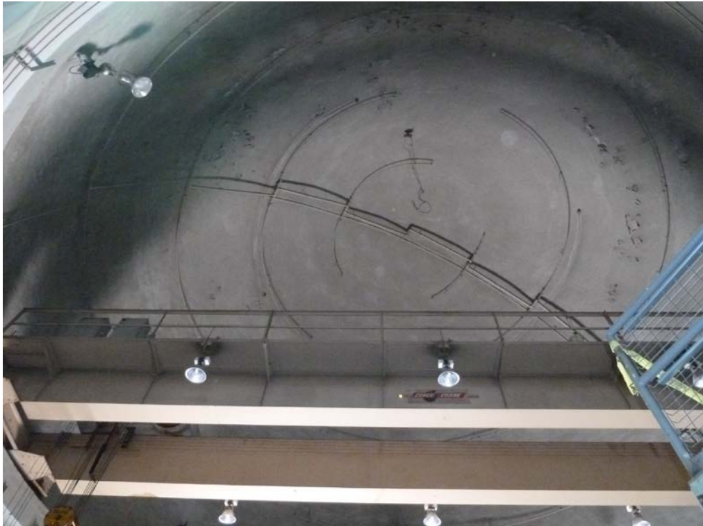
Photo 2. Flaking lead-based paint (LBP) containing polychlorinated biphenyls (PCBs) on the ceiling of the aboveground containment dome.