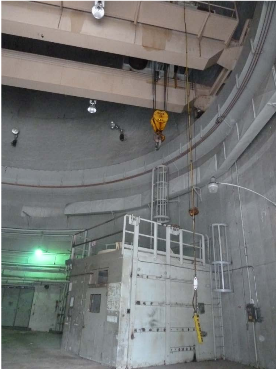
Photo 6. Portion of interior of aboveground containment dome. Brown paint shown in photo contains lead and PCBs. Handrails and interior surfaces of steel containment dome also contain layer(s) of LBP with PCB constituents.