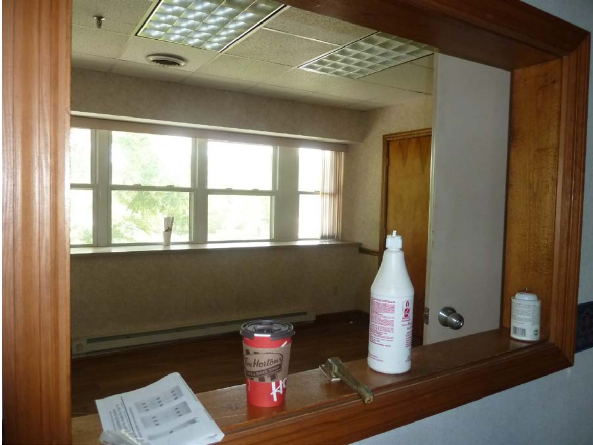
Photo 13. Northernmost office in the administration building. Drywall and wall paneling have LBP. False wood flooring overlies asbestos flooring and therefore will need to be removed during abatement. False walls were constructed to create the three offices. These will need to come out during asbestos abatement, as well, so that the ACM flooring can be accessed.