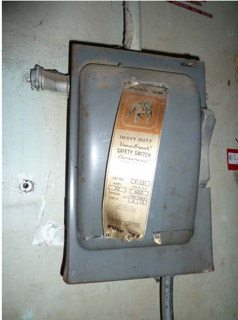
Photo 12. Example of a switch which likely contains mercury. Such switches are throughout the aboveground buildings at the PDRS, and would be handled by trained workers and disposed of at state-approved facilities.