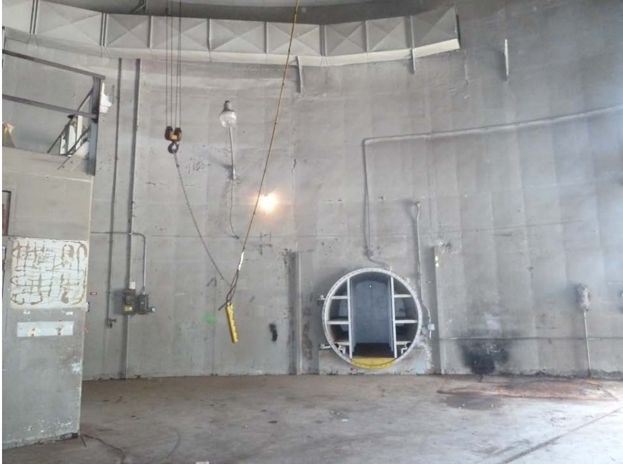
Photo 5. Round air-lock from interior of aboveground containment dome to outdoor locker that leads to administration building.