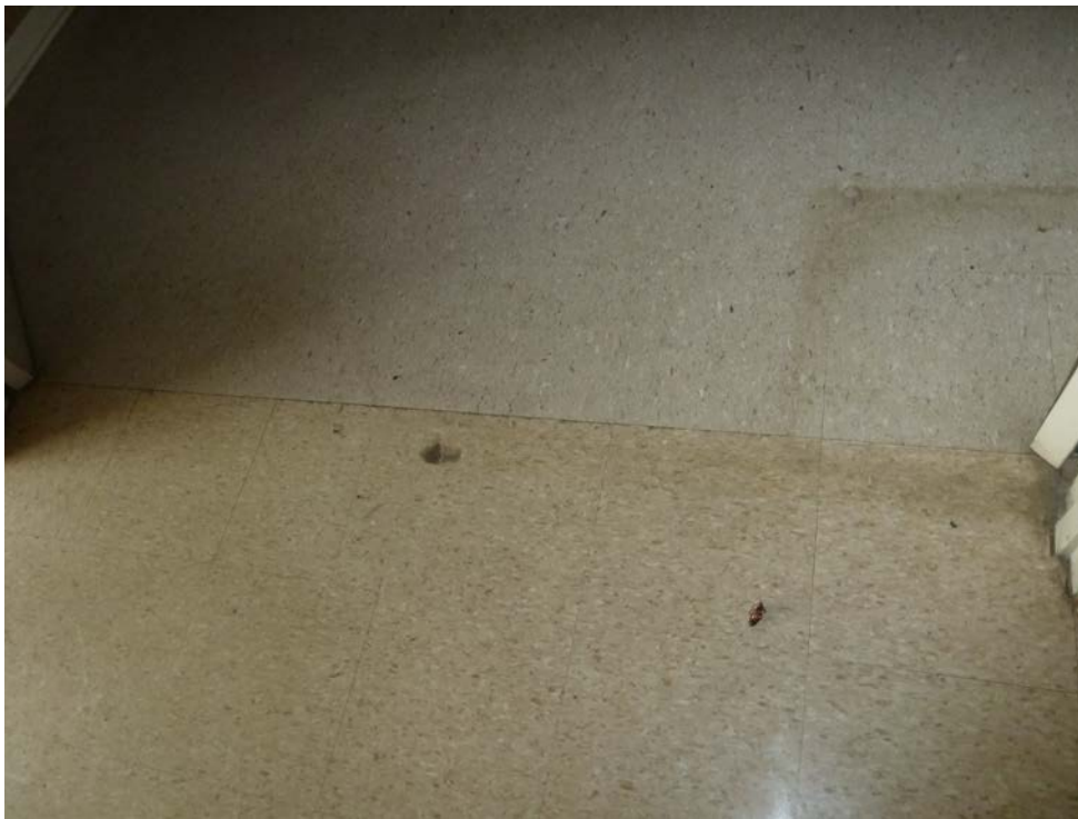
Photo 11. Darker floor tiles in bottom portion of frame contain asbestos and will be abated prior to the proposed demolition. Newer tiles in upper portion of frame do not contain asbestos and therefore will remain in administration building. Floor tiles within three offices within this building contain asbestos.