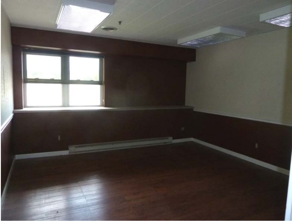
Photo 14. One of the three offices in the administration building. The falls wood floors overlie ACM flooring, which will be abated prior to the proposed demolition.