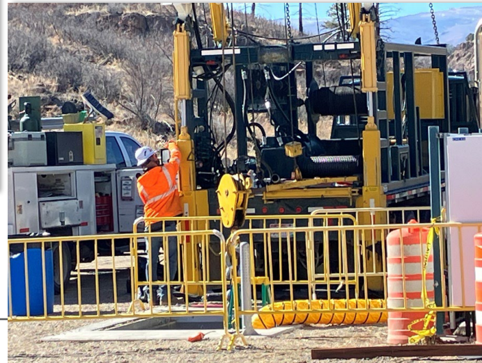
CrEX-4 Well Maintenance