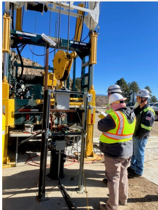
R-42 Spinner Test