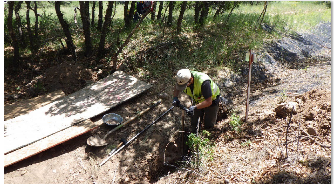
SWMU 08-004(c) Soil Sampling