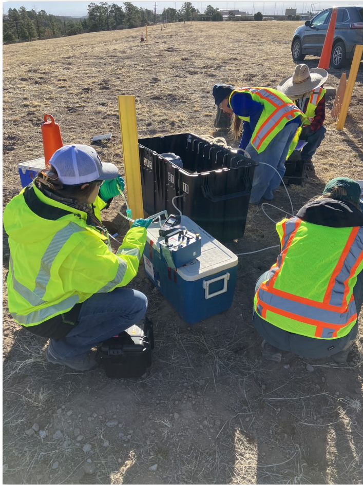
MDA C Vapor Sampling