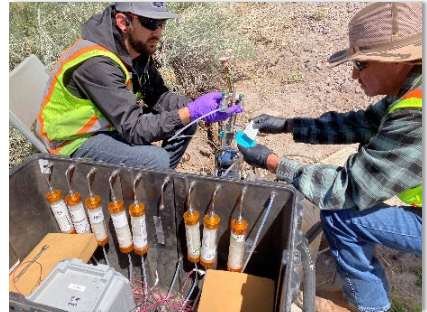
MDA L Vapor Sampling