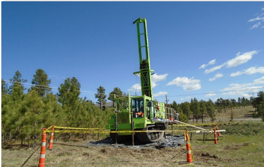
Sonic Drill Rig to Collect Samples at SWMU 09-013