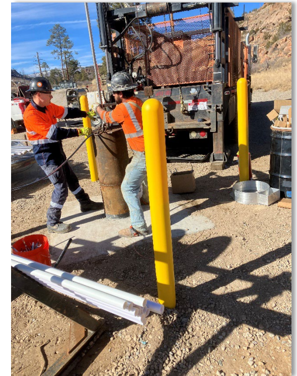
R-76 Installation of Permanent pump Sampling System