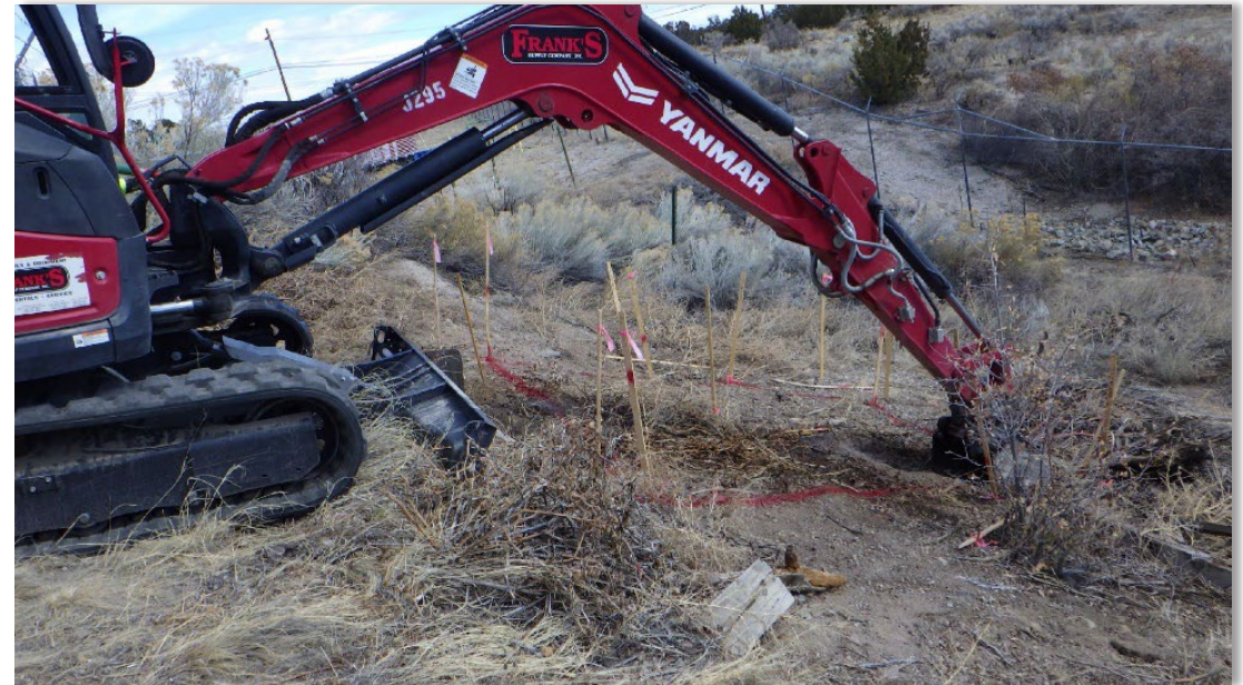
SWMU 33-012(a) remediation activities