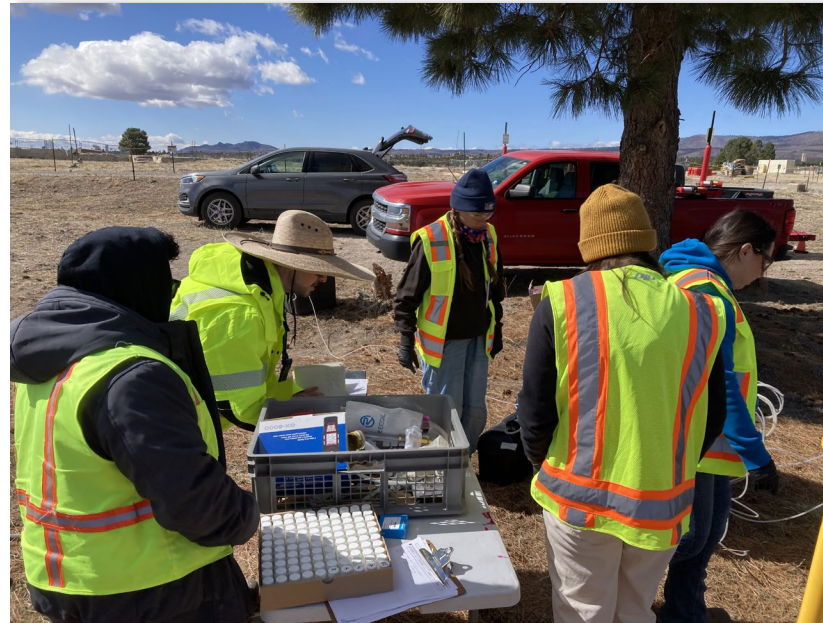
MDA T Vapor Sampling