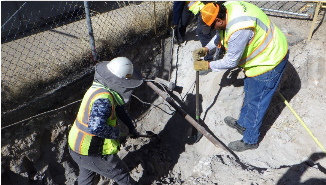
AOC C-33-001 remediation activities