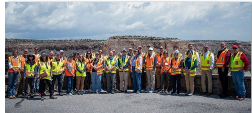
National Governors Association Tour