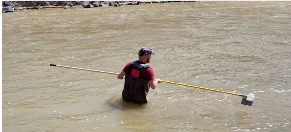
Sampling Rio Grande at Otowi Bridge