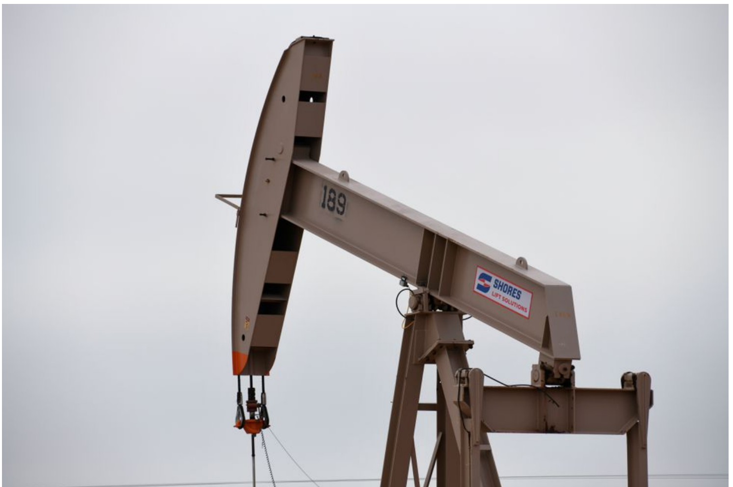
A pump jack operates in the Permian Basin oil and natural gas production area near Odessa, Texas, U.S., February 10, 2019. Picture taken February 10, 2019.

June 30 (Reuters) - U.S. natural gas futures plunged about 17% on Thursday to a three-month low as the shutdown of Freeport LNG's liquefied natural gas (LNG) export plant in Texas allowed utilities to stockpile more fuel than expected even as hotter weather had generators burning more gas to keep air conditioners humming.