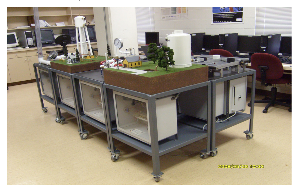
Figure 2. Critical Infrastructure Protection Center SCADA Lab

managed or maintained by IT staff in industrial settings. Such systems are pervasive in what is today referred to as our national critical infrastructure as defined by the U.S. government under Homeland Security Presidential Directive-7<sup>8</sup>. While much of this software is