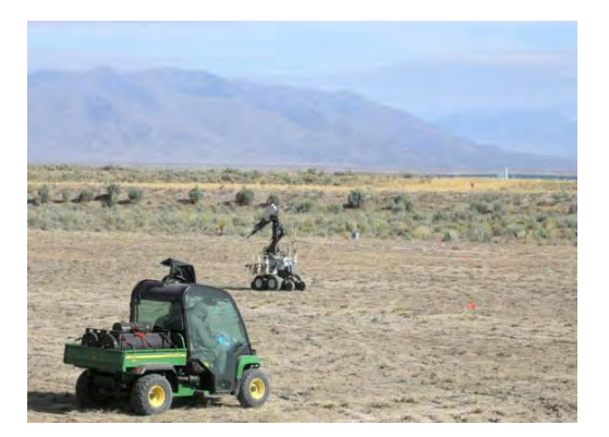
Figure 4. South Training Range area during initial testing activities.

This alternative restricts project activities in the areas surrounding the T-28 Gravel Pit to minimize impact to biological and cultural resources. The project activities at the other locations (i.e., TAN/TSF, TAN Parking Lot, and the South Training Range) would remain the same as described in Alternative 1a.