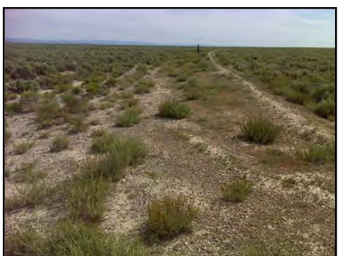
Figure 3. Berm/Ditch, Looking from north to south from the _Arc' road toward the T-28 Gravel Pit.

outside the south boundary of the gravel pit (right and left of the entrance road) as equipment laydown/storage areas along the southeast road for placement of command posts (100 x 100 feet).