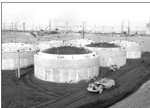
Construction of storage tanks at the Hanford Site

An OIG audit disclosed that sludge removal operations on the Spent Nuclear Fuels (SNF) Project at the Department's Hanford Site have not commenced according to schedule and have experienced significant cost overruns. While technical difficulties with the sludge removal have contributed to delays, we determined that neither the Department nor the contractor assigned responsibility for managing the project focused adequate attention on the sludge removal portion of the SNF Project during the critical planning phase.