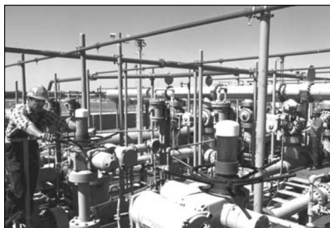
Employees work on piping at the Strategic Petroleum Reserve in West Hackberry, Louisiana

The Strategic Petroleum Reserve is designated as part of the Department’s critical infrastructure. An OIG inspection concluded that additional measures could be implemented to improve physical security at the Reserve. Specifically, the inspection found that the level of protection against the “insider threat” and the Reserve’s deadly force policy may not be commensurate with its designation as a part of the Department’s critical infrastructure. Additionally, the inspection determined that opportunities exist to improve