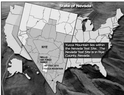
Map of Yucca Mountain in Nye County, Nevada

A United States House of Representatives Report for the Fiscal Year 2004 Energy and Water Development Appropriations Act directed the Department to audit the use of oversight funds associated with the Yucca Mountain Project to determine if the State of Nevada and affected units of local government used oversight funds in accordance with the terms of the Nuclear Waste Policy Act . Our audit questioned $1.2 million of the $11.7 million in oversight funds spent by Nye, Lincoln, and Clark counties as well as the State of Nevada during Fiscal Years 2003 and