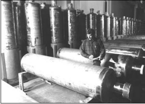
View of canisters that hold high-level waste at the Savannah River Site

An OIG audit found that deactivation and decommissioning activities completed by the Westinghouse Savannah River Company at the Savannah River Site did not always result in a reduction in the risk posed to the environment, workers, or the public. Specifically, approximately 67 percent of the facilities completed by August 2004, at a cost of $7.8 million, posed little or no risk to the environment, workers, or public. In addition, at the time of our review, 22 facilities that did pose environmental, safety, and health risks had not been scheduled for deactivation and