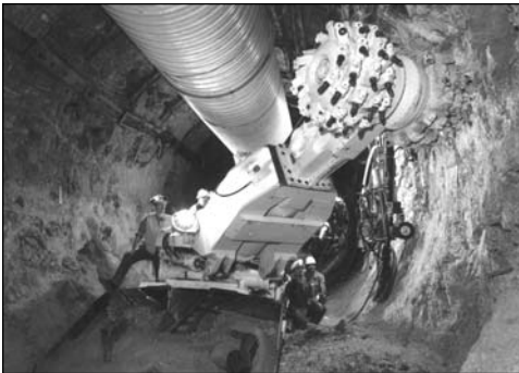
Alpine mining machines excavate alcoves for testing at Yucca Mountain

An OIG audit found that since 2001, the Office of Civilian Radioactive Waste Management (OCRWM) paid approximately $4 million in incentive fees to the Department contractor managing its Yucca Mountain Site even though contract performance expectations were not met. Specifically, we determined that OCRWM paid incentive fees despite the fact that: