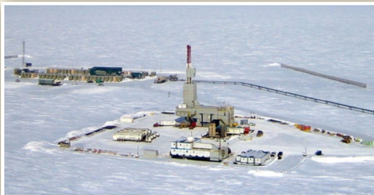
Nordick #3 Drill Rig at site of Iñnik Sikumi #1 well, Prudhoe Bay Unit, Alaska, in April 2011.