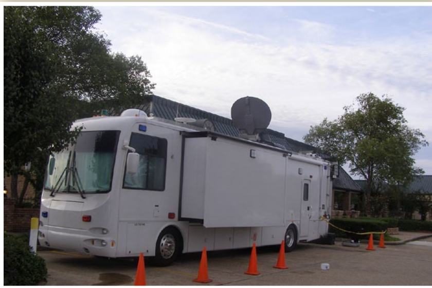
An Emergency Command Vehicle deployed during Hurricane Gustav in 2008.