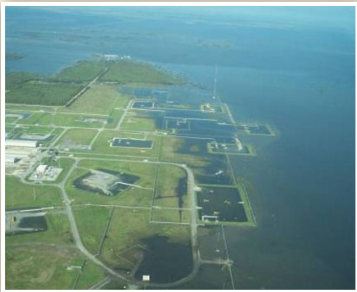
The flooded surface of Cavern Six at the West Hackberry, La., site after a hurricane.

The staff at the Program Office in Washington, D.C., and at the Project Management Office in New Orleans, La.,