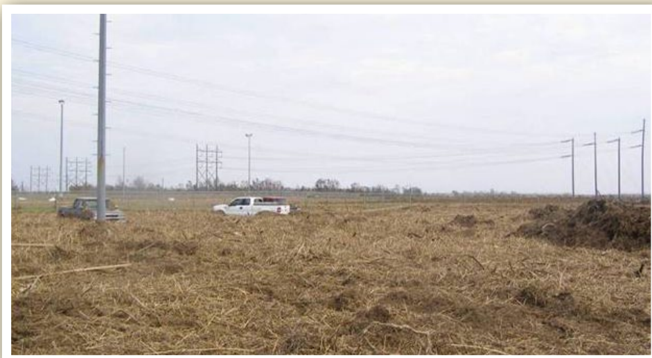
A hurricane left the parking lot at the Big Hill site covered with close to 3 feet of debris.