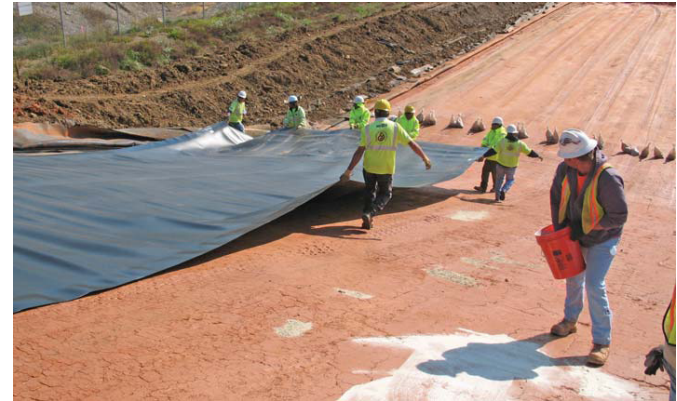
Workers install a geosynthetic liner during the construction of Cell 5 at Oak Ridge