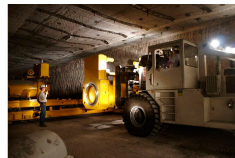
Facility cask being placed on RH-TRU horizontal emplacement machine.