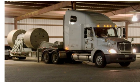
First GEVNC Shipment to WIPP