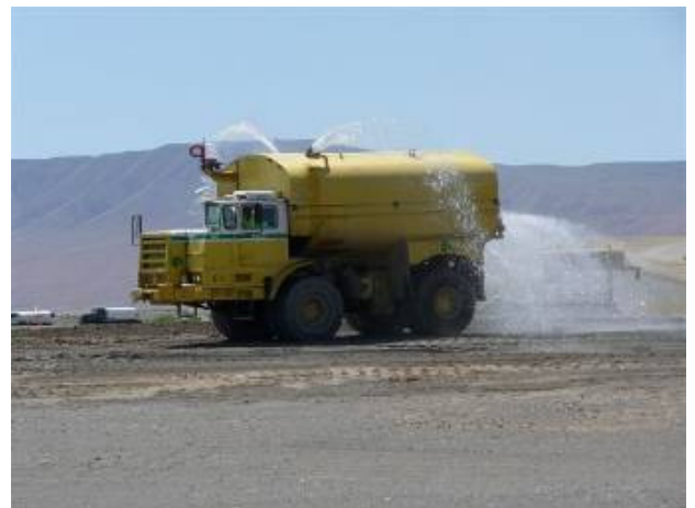
(Right) An order was placed in June for another water truck, similar to the one pictured, to help control dust from increased traffic and waste disposal operations at the Environmental Restoration Disposal Facility.

Facility upgrades include expanding the container transfer area, rerouting roadways and traffic patterns, and building additional dump ramps. To support the effort, orders for new equipment placed in late June included a water truck, two bulldozers, 6 shuttle trucks and a new scale. The improvements will allow an increase in the facility's capacity to accommodate the increase in waste volumes from other Hanford contractors.