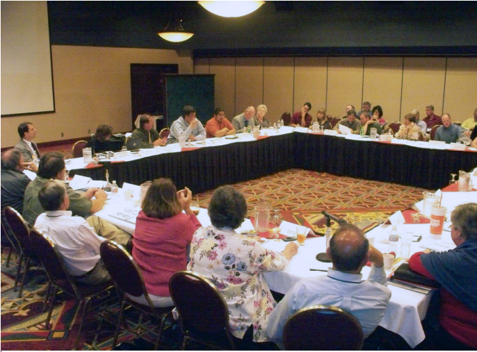
(Above) The impact of the Recovery Act on local communities was a key topic at the meeting of the National Conference of State Legislatures in Richland, WA. Twenty-four lawmakers from six states attended the meeting.