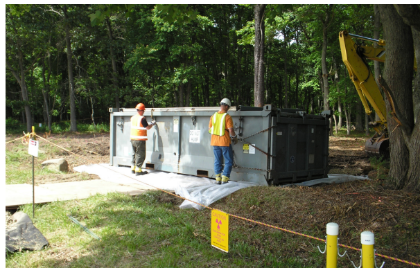
(Above) Soil Excavation and Waste Packaging in Progress