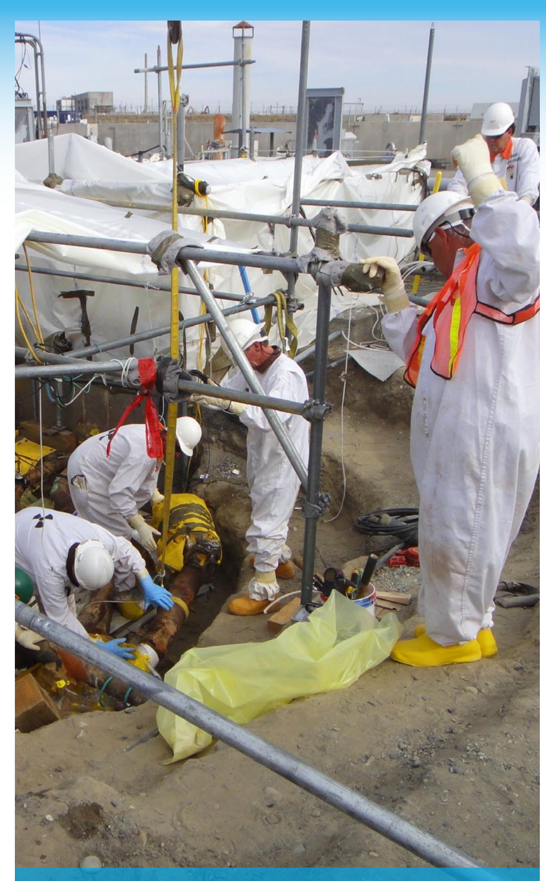
Workers remove the first portion of old pipe-in-pipe waste transfer lines from Hanford's SY Farm. The Recovery Act-funded project calls for a total of eight pipe-in-pipe waste transfer lines to be removed from the farm by the end of September 2011.

The project supports the long-term mission of the tank farms by accelerating essential upgrades needed to prepare the farms for safe and reliable delivery of waste to WTP. \square