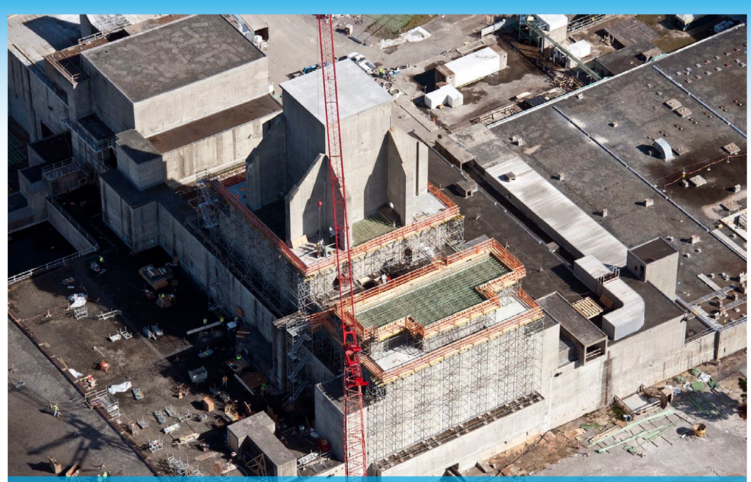
Workers prepare for roof modifications on portions of P Reactor at Savannah River Site that are expected to remain after facility decontamination and demolition efforts.