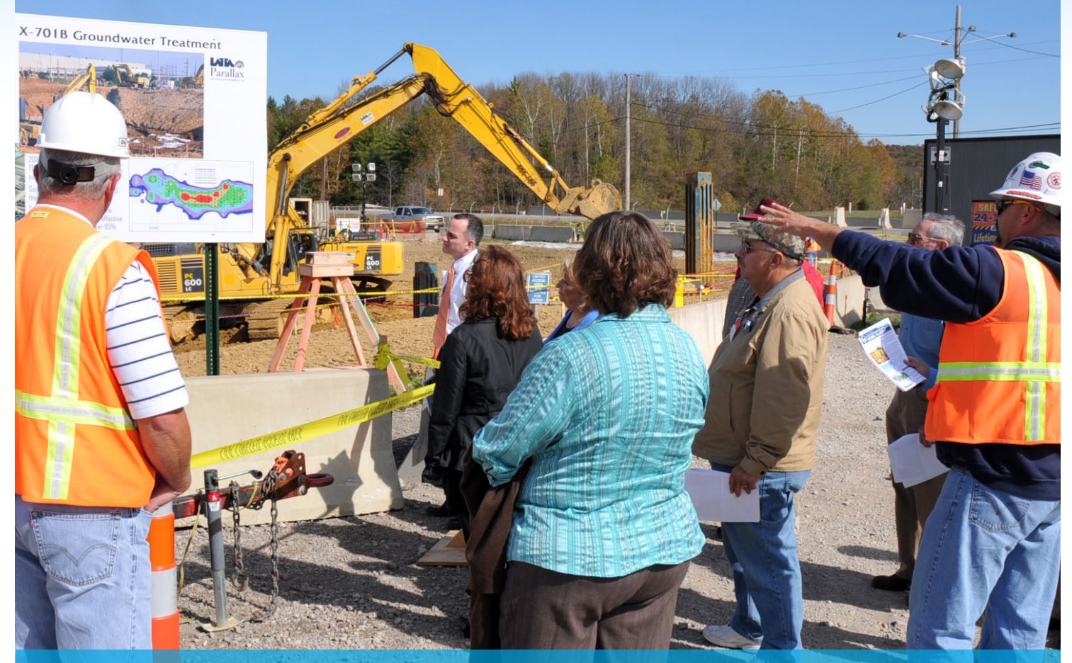
Members of the Portsmouth EM Site-Specific Advisory Board receive a field briefing on the Recovery Act-funded groundwater source removal project at the Portsmouth Gaseous Diffusion Plant.

PIKETON, Ohio - Recovery Act workers have reduced contaminant levels by 96 percent in soil 30 feet below ground in what has been coined the Portsmouth Gaseous Diffusion Plant's "Big Dig."