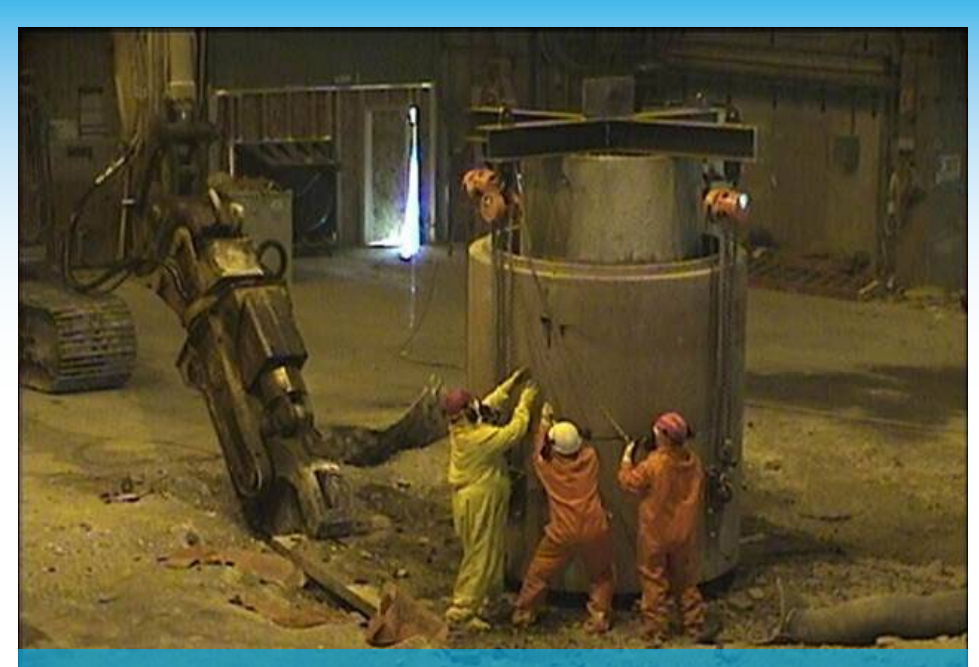
Workers install high-density concrete culverts to increase shielding around the Materials Test Reactor at the Reactor Technology Complex.