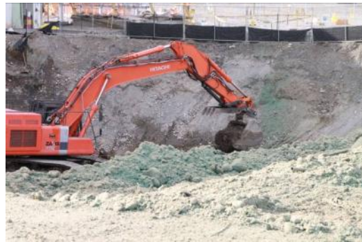
Removal of contaminated soil under the former location of the K East Reactor Basin This aerial shot (left) shows heavy equipment (right) excavating contaminated soil from a site next to the K East Reactor where a basin once stored 2,300 tons of spent nuclear fuel and radioactive sludge.