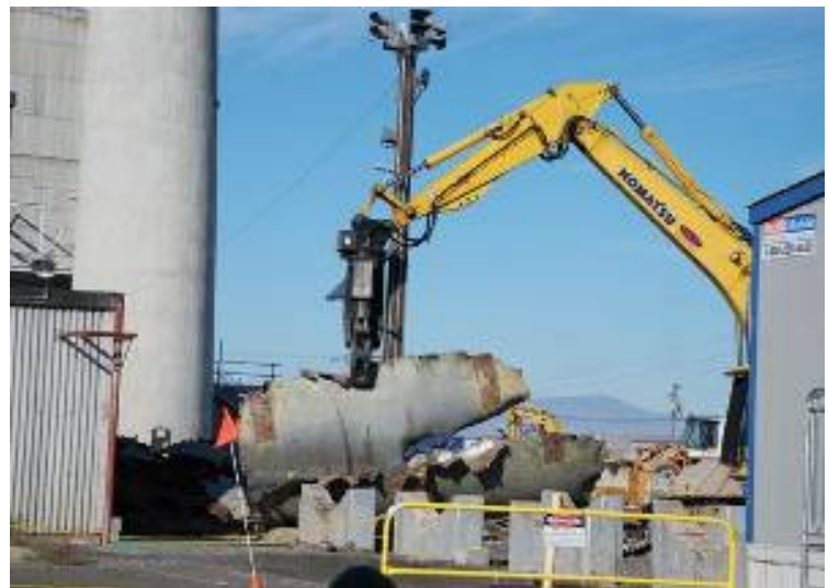
The gas storage facility before and during demolition CH2M HILL completed demolition and disposal work on four tanks in just a few weeks with Recovery Act funds. Removing these structures is part of a larger effort to prepare for the disposition of two former nuclear reactors.