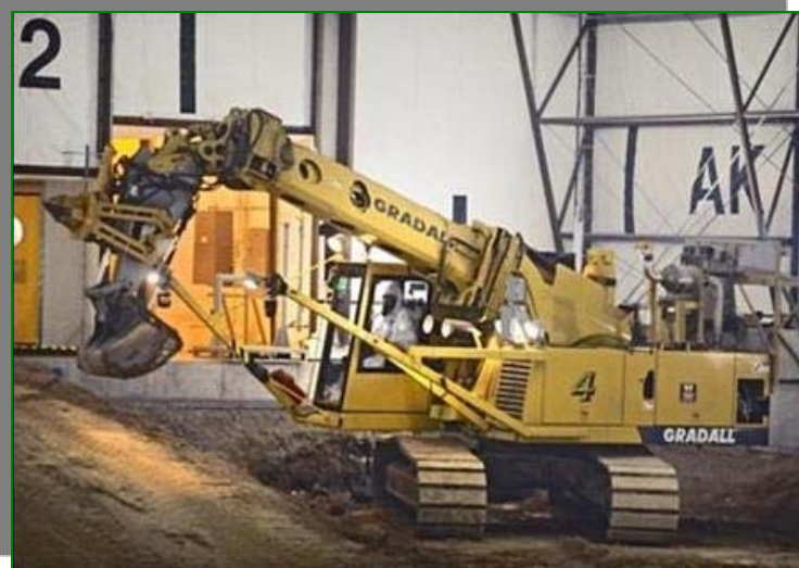
An excavator exhumes waste inside the retrieval area.

Targeted waste includes process sludges, filters, graphites and oxidized (depleted) uranium. These materials originated at the Rocky Flats Plant near Denver, CO, and were packaged into shipment containers and sent to Idaho for disposal.