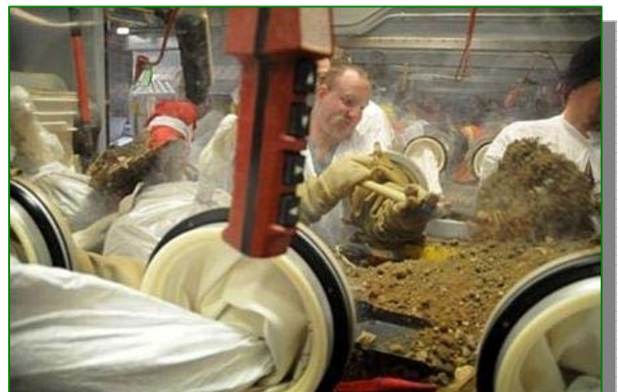
CWI workers sort through the exhumed waste.