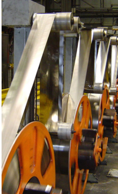
Giant spools at Metglas’ facility in Conway, S.C., hold the thin metal alloy used in the cores of Amorphous Metal Transformers.

“Electricity is transmitted across power lines at very high voltage, and transformers are needed to reduce that voltage to a usable level,” says Dave Millure, Metglas’ Senior VP of Sales and Marketing. “Amorphous Metal