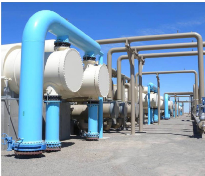
The Faulkner 1 geothermal power plant sits atop Blue Mountain, just outside Winnemucca, Nev.

“Nevada Geothermal Power ... has been a great addition to [Winnemucca’s] industrial makeup,” Di An says. “They have provided diversity to our job base, which is a key element in our community’s growth. Even more so, they have put our area on the green energy map.”