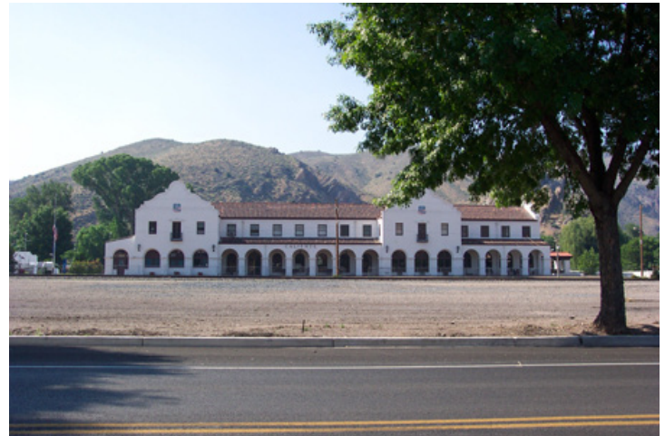
Caliente, Nev.'s, city hall, a former railroad depot built in 1923, is receiving a new HVAC system.

The U.S. Department of Energy cost shared the exploration of the Blue Mountain site under its Geothermal Resources Exploration and Definition program.