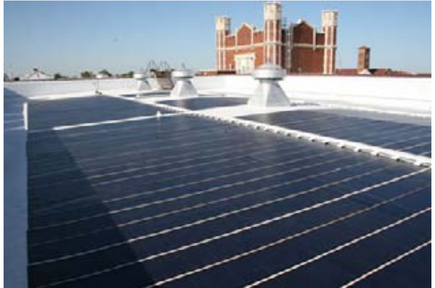
View of the solar panel system atop Warren Easton Senior High School in New Orleans